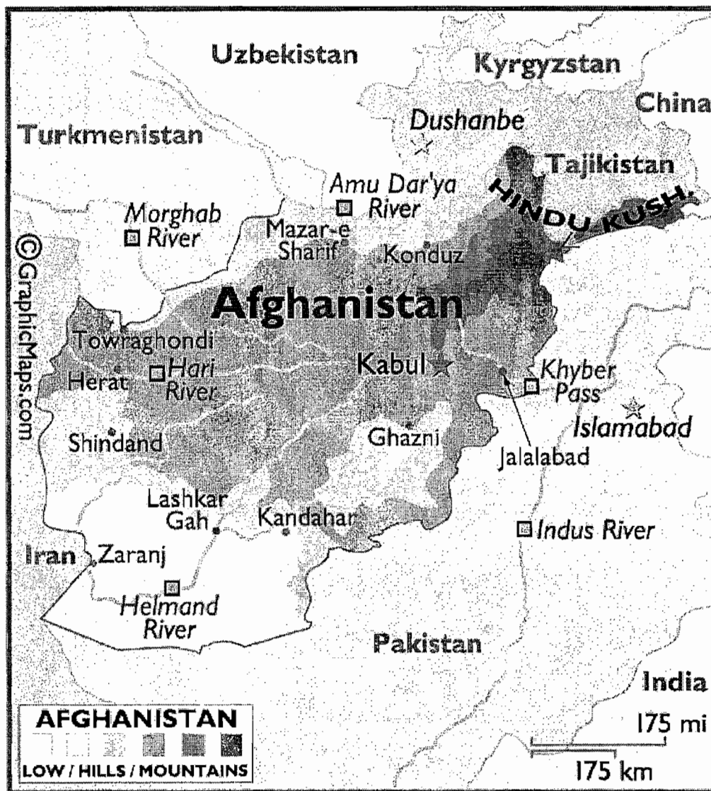
Regional Map of Afghanistan (2010)