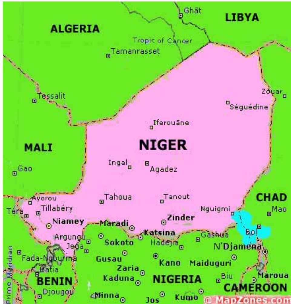
Figure 5. Map of Niger