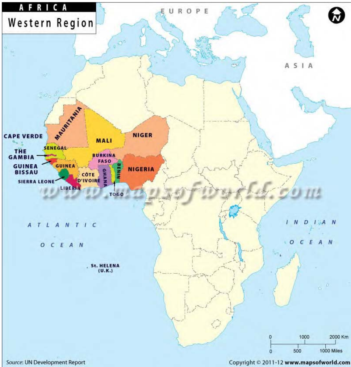
Figure 1. Map of West Africa