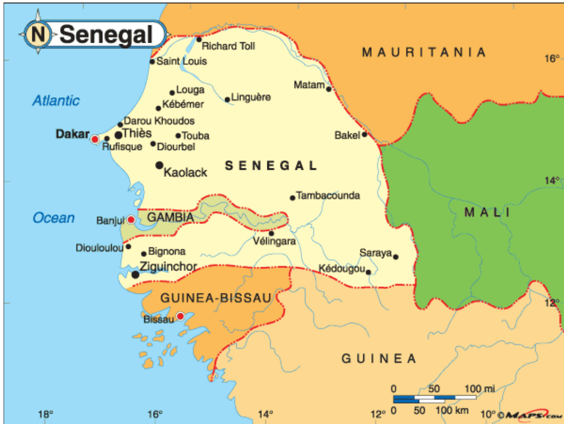
Figure 4. Map of Senegal

earlier, Senghor`s one-party democracy is soon challenged by students and their trade union partners.