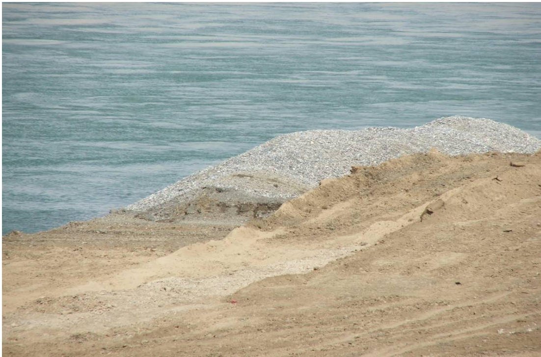
Site Photo 4: River Rock and Gravel Dredged from River Bed

Approximately 20 meters of the river crossing corridor is large rock or bedrock, which required fracturing and excavation. Mechanical fracturing with the extended reach excavator shown in Site Photo 5 is planned with equipment now on site. The alternate plan is the use of explosives to fracture the bedrock for removal. At the time of the site visit, this work had not begun, and therefore was not observed during the site visit.