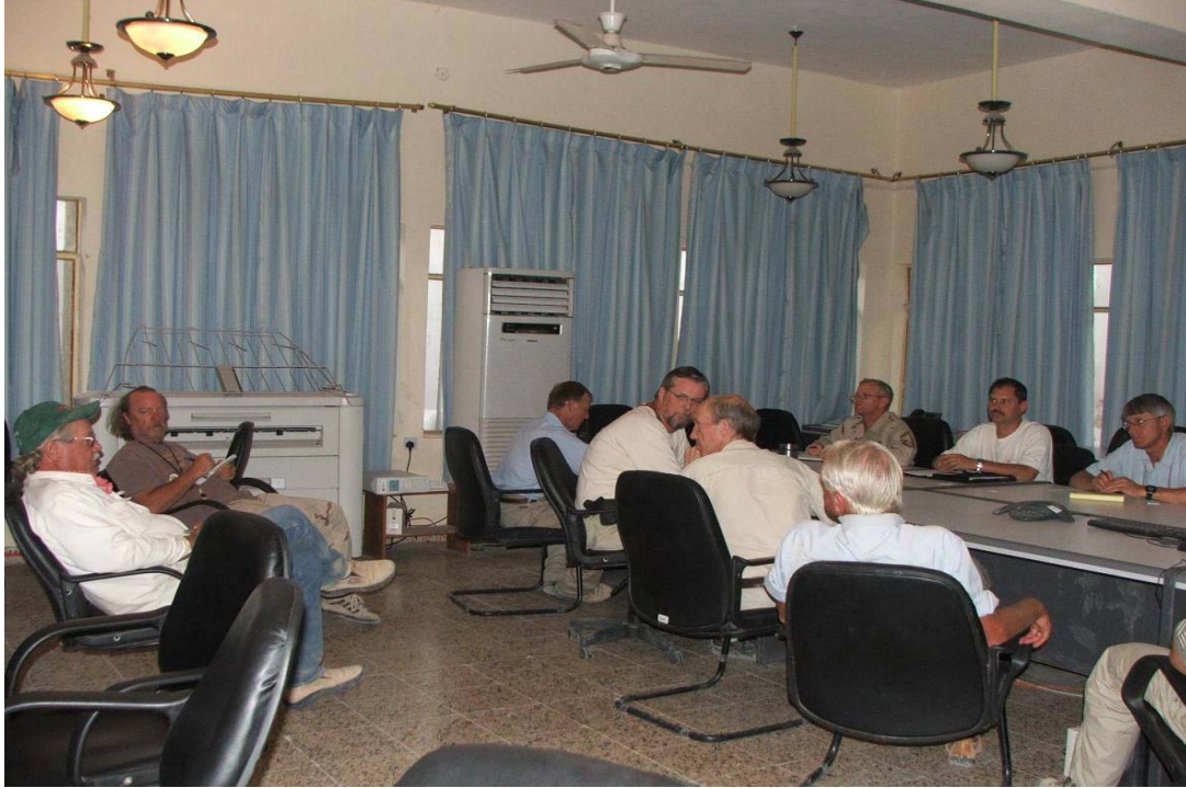
Site Photo 14: Contractor and Government Managers Conduct End of Day Meeting