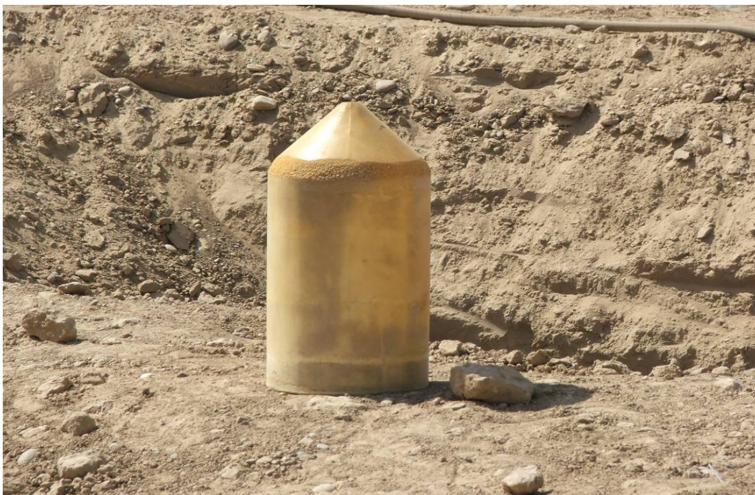
Site Photo 6: 20-Inch Pig