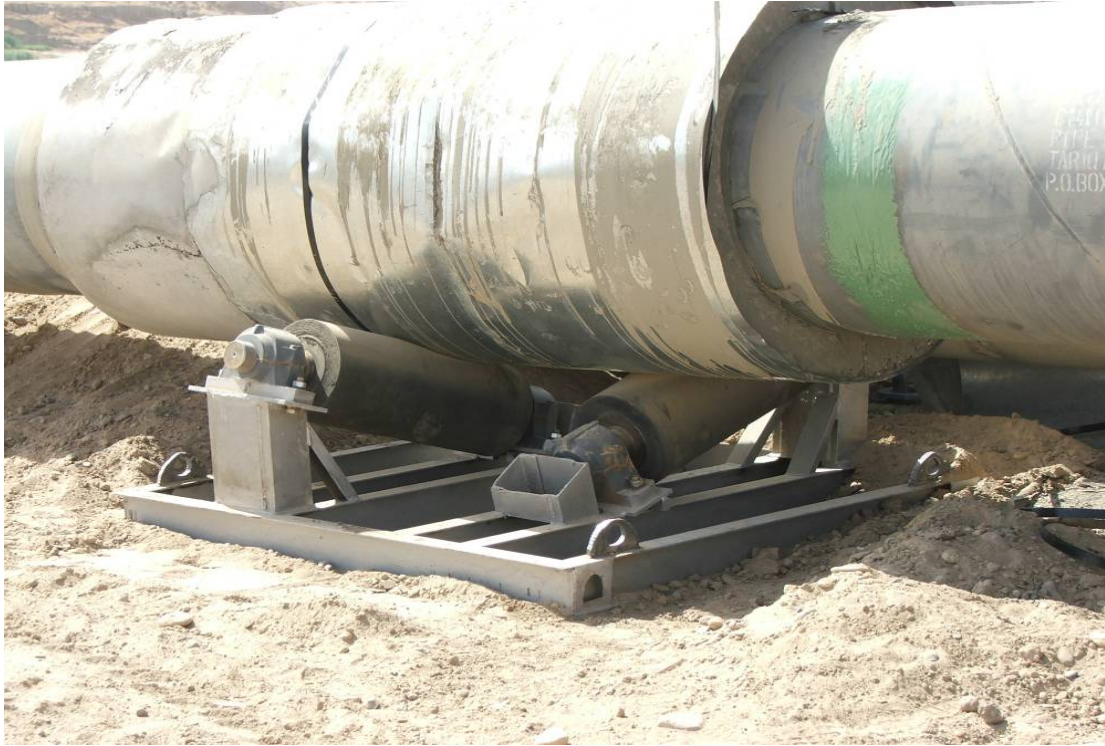
Site Photo 1: 40-Inch Pipeline on Rollers

strung on the east side of the Tigris River. In addition, the welding was complete on the nine pipelines to be installed in the Tigris River. The 40 inch pipeline was placed on rollers in preparation for the first pull across the Tigris River. Site photo 1 shows a 40-inch pipeline on rollers. The welded pipeline strings shown are 1241 feet in length. The work observed was consistent with the requirements of the PSSR.