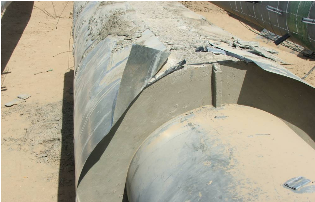
Site Photo 3: Section of Pipe Encapsulated in Concrete