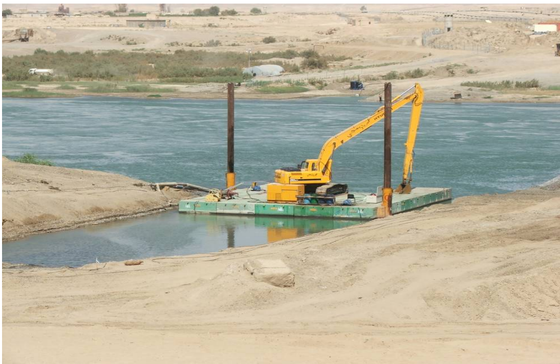
Site Photo 5: Excavator for Dredging on Tigris River