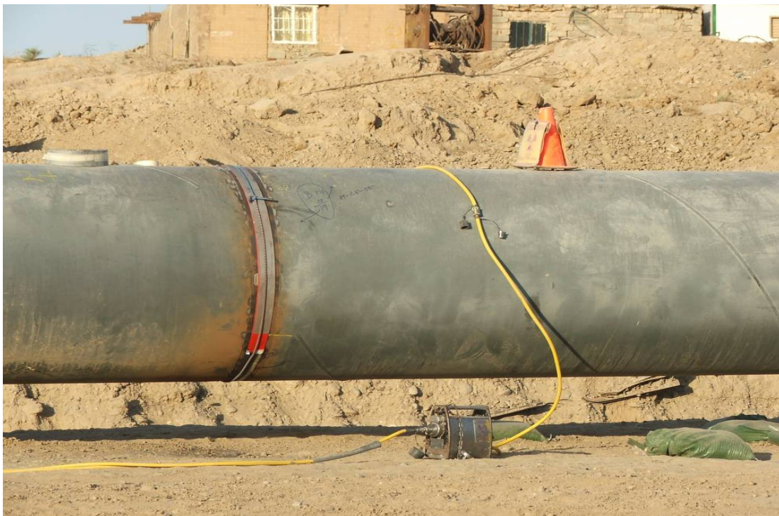
Site Photo 8: Radiography (x-ray) Test In Progress on 40-inch Pipe Weld