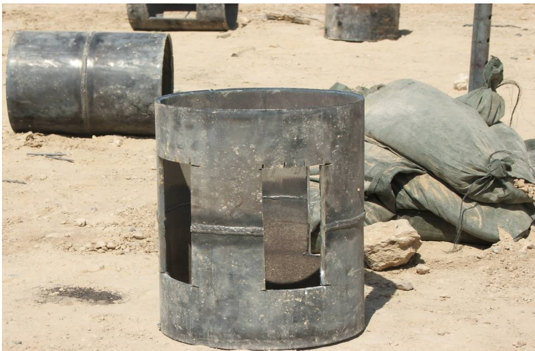
Site Photo 12: Test Section Cut for Destructive Test