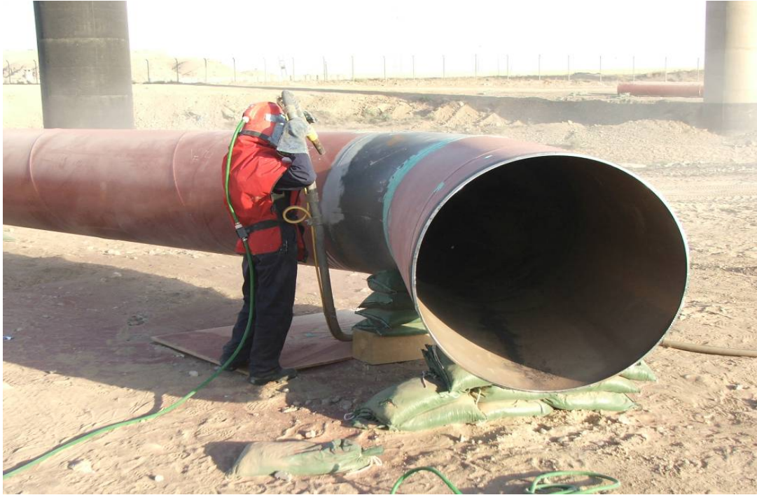
Site Photo 10: Sand Blasting to Prep Pipe for Protective Epoxy Coating