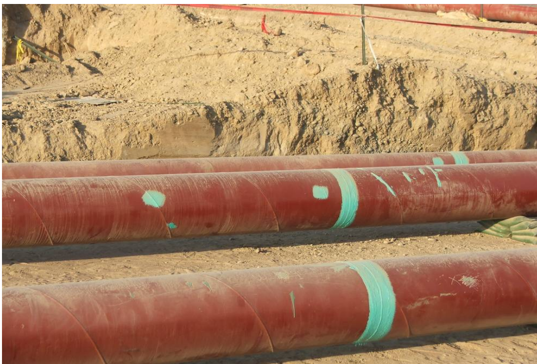
Site Photo 9: Corrosion Control Epoxy Following Holiday Test