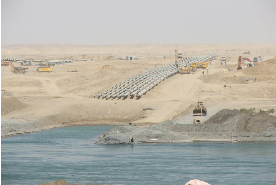
Site Photo 2: Pipes Staged on Tigris River East Bank