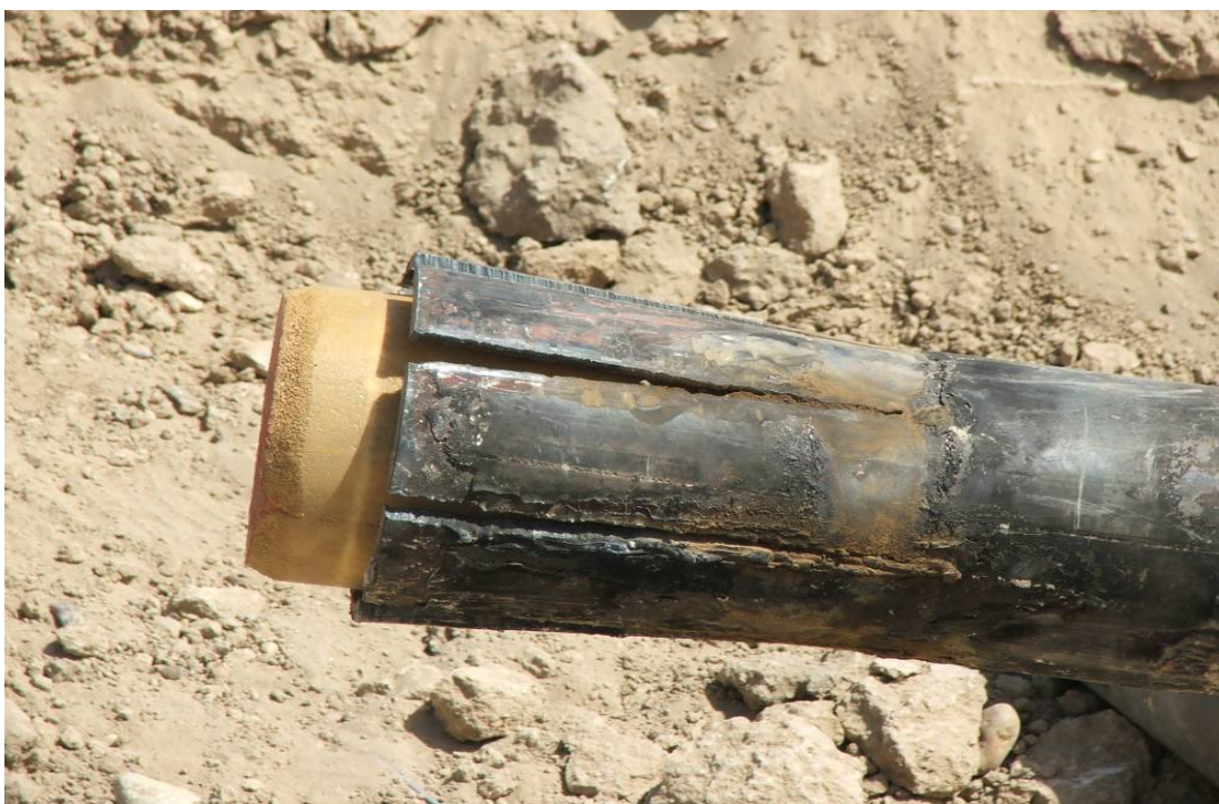
Site Photo 7: Pipe Ready for Pigging