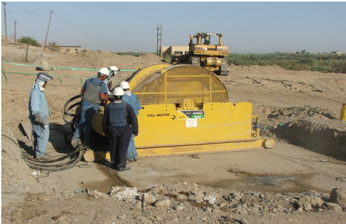
Site Photo 13: Field Supervisor Oversees Winch Cable Change-Out

In Site Photo 13, one of the contractor's foremen oversees the changing of the steel winch cable from 1.5 inches to 2 inches to ensure enough cable strength to pull pipes across the river.