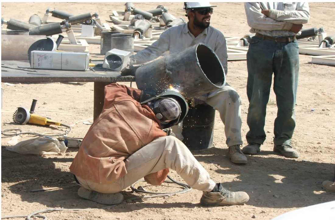
Site Photo 11: Iraqi Welder Applicant Demonstrated Skills