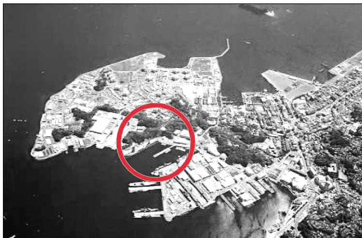
Projects supporting USS George Washington were built on a limited-size area of Yokosuka Naval Base.

Foremost and impacting all aspects of the program was the finite date established for the USS George Washington 's arrival. The date, driven by the passing of the USS Kitty Hawk 's 15-year service life extension after a 1987–1991 overhaul, put the project start on a tight schedule.