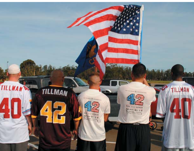
Members of the 30th Civil Engineer Squadron participate in a squadron-organized run to raise funds for the Pat Tillman Foundation in honor of fallen service member Cpl. Pat Tillman, Vandenberg Air Force Base, Calif., 17 April 2010

Determinations of public trust associated with integrity, competence, and predictability are arrived at through reason. People often base these on incomplete knowledge informed by the public's perception of the practices or principles on which the organization has agreed to abide. Integrity determinations reflect perceptions of an organization's adherence to implicit or explicit commitments, and normative assessments of its honesty and fairness in meeting those commitments. Lack of integrity can easily lead to perceptions of opportunism.