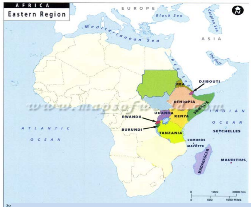
Figure 1. Eastern Africa Region

The EAR is the region on the eastern part of Africa, including the territories occupied by the fourteen states that form the East African Region and the islands therein. The members include Burundi, Comoros, Djibouti, Eritrea, Ethiopia, Kenya, Madagascar, Mauritius, Rwanda, Seychelles, Somalia, Sudan, Republic of Tanzania, and Uganda; and as of July 9, 2011, the newly independent Republic of South-Sudan as shown on figure 1.