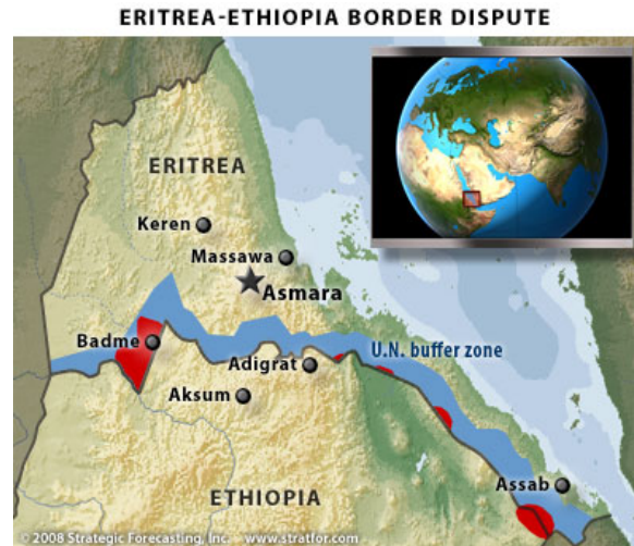
Figure 4. Eritrea-Ethiopia border dispute