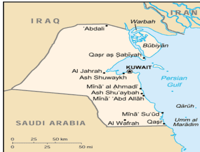
Figure 3. Iraq-Kuwait border

During the Iran-Iraq war, Kuwait provided extensive support to Iraq, in the form of loans, and allowed Iraq to use its territory as depth, with fighters and bombers launching from Al-Ahmadi Air Base. In addition, Kuwait authorized the building of a pipeline through Kuwait to carry Iraqi oil to the Red Sea port of Yanbu in Saudi Arabia.