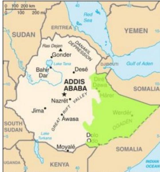
Figure 5. The Ogaden Region

between the two states remains provisional, and the Ogaden region is in a state of contestation. Figure 5 shows the Ogaden region (shaded green).