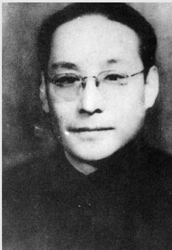
Pan Hannian, ca. 1950s.

Thirdly, Pan had overseen postwar counterintelligence operations in Shanghai that had deployed pre-1949 defectors from the Kuomintang as double agents, and he had directed deception operations with