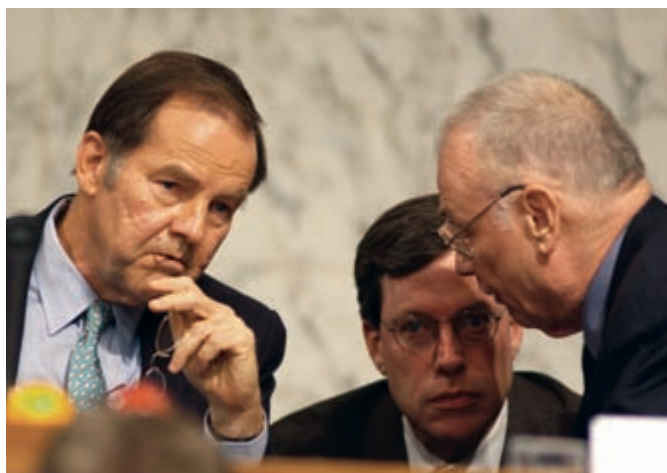
9/11 Commission Chairman Kean (l), Vice Chairman Hamilton (r), and author discussing testimony on 13 April 2004.

This was true for the creation of several of the major institutions created in the 1940s and 1950s, like the Joint Chiefs of Staff and the Office of Special Services. It was true again.