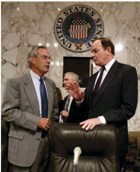
Porter Goss and Richard Shelby, chairs, respectively, of the House and Senate intelligence committees, confer before opening on 18 September 2002 of the Congressional Joint Inquiry into the events of 9/11.

(alerting to possible flight school activity by potential hijackers, though I think this episode is exaggerated a bit by hindsight). The JI was not able to pursue some of the leads it uncovered, some fruitful some not, to firmly evidenced conclusions. The 9/11 Commission was later able to stand on the shoulders of the JI's original work and excellent work done by a CIA analytic team as well as the very thorough FBI "PENTTBOM" investigation—the shorthand name of FBI's investigation of 9/11.