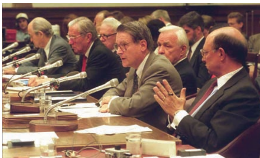
Six former DCI’s in May 1995 appeared before the House Select Intelligence Committee, whose report in 1996 proposed separation of the DCI from CIA’s management, among other major recommendations.

Aspin-Brown declined to quarrel over the key DoD powers. Its report promised not “to alter the fundamen-