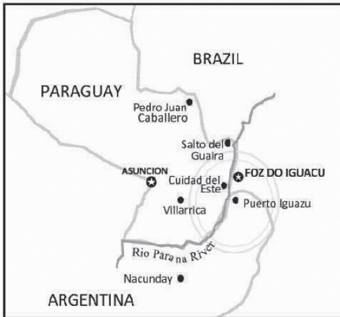
Figure 2. Tri-Border area map. Created by U.S. Special Operations Command Graphics.

In 2002, after the tragedy of 9/11, Argentina, Brazil, and Paraguay invited the United States to create the “3+1 Counterterrorism Dialogue,” a mechanism focused on terrorism prevention, CT policy discussion, information sharing, increased cross-border cooperation, and mutual CT capacity building.