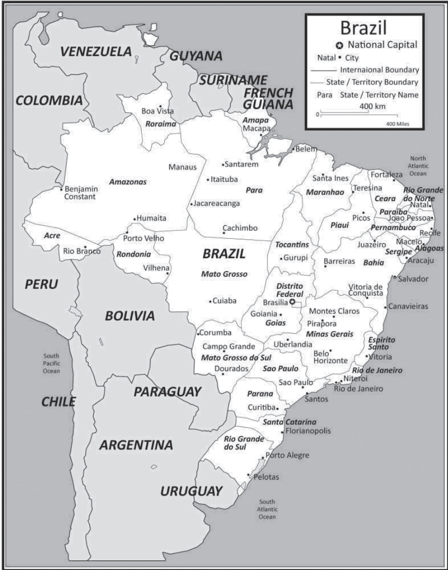
Figure 1. Map of Brazil. Created by U.S. Special Operations Command Graphics.

countries for a long time. There have been many international pressures on the area, including incursions by foreign powers starting as early as the 16th and 17th centuries. Brazil resisted the threats to its sovereignty in different regions. 5 There are still significant challenges to overcome as Brazil pursues the settlement and development of the Amazon region.