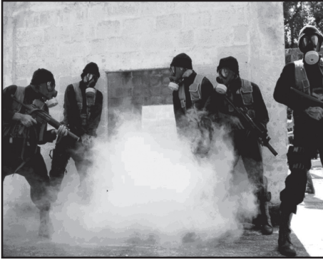
Top: The 1st Special Forces Battalion on an urban terrain counterterrorism training operation