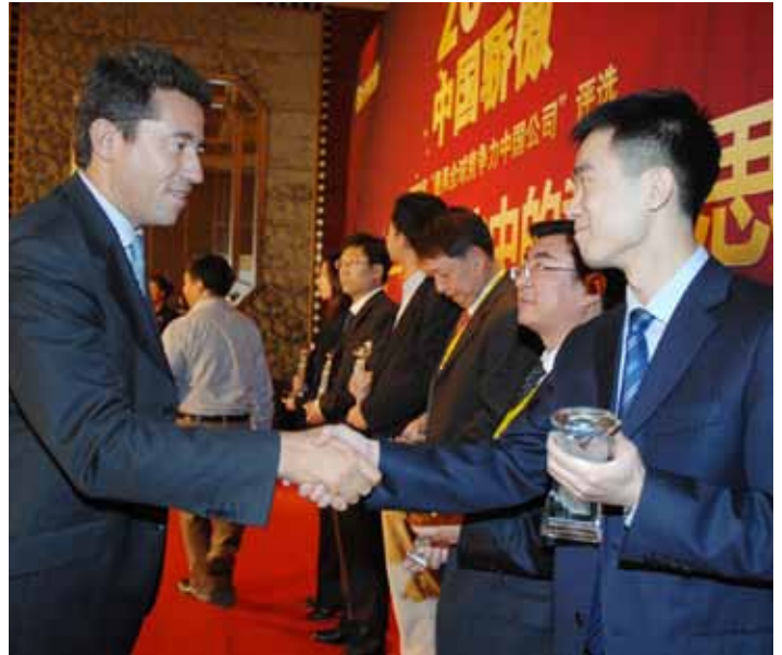
2009 winners of the Most Globally Competitive Chinese Companies Award.