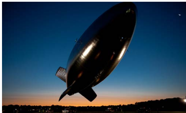
Figure 7. High Altitude Airship