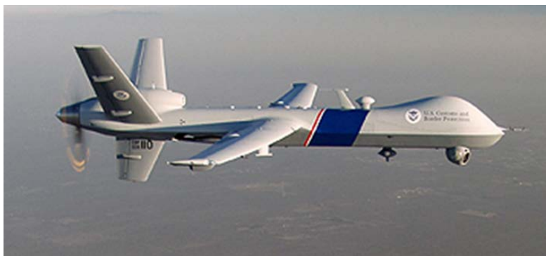
Figure 2. CBP MQ-9 Predator B.

based radar, Unmanned Aircraft Systems (UAS) (see figure 2.), and gamma ray/x-ray imaging trucks (Backscatter). DHS also fielded programs to conduct online training, mapping and satellite imagery software to increase situational awareness, and third generation mobile infrared cameras. Still, the overarching integrated technology structure that the aborted SBInet proposed remained elusive. Technology remained a piecemeal enabler, rather than the coalescing force behind sustained operations.