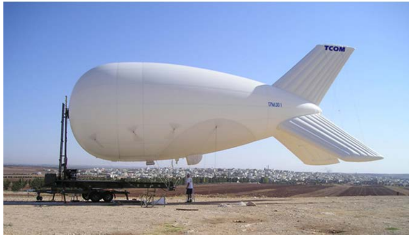
Figure 4. TCOM 17M RAID Aerostat

filled with low pressure helium. They can remain aloft for several days at a time and serve multiple roles such as a communications relay, aerial navigation and radar.