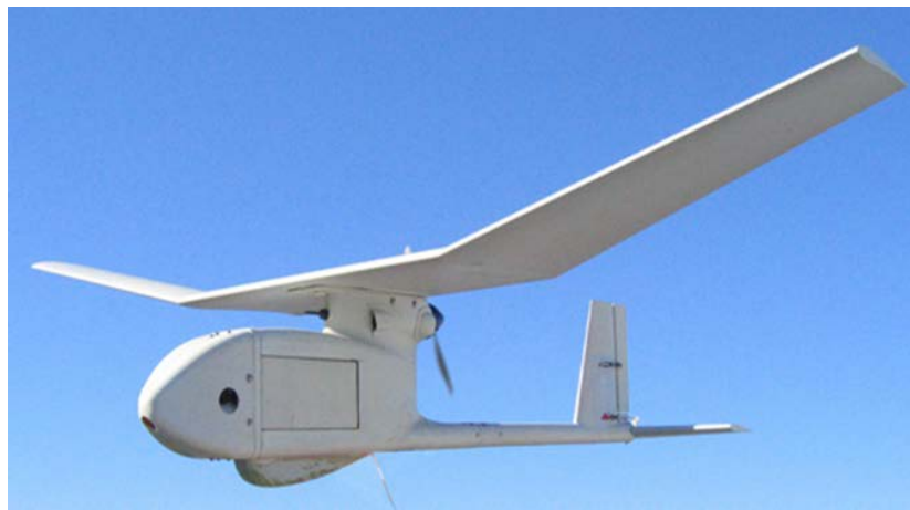
Figure 10. RQ-11 Raven sUAS