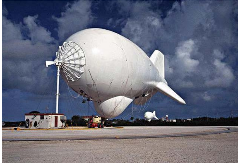
Figure 1. Tethered Aerostat Radar System

planes. In 1988, U.S. Customs introduced the P-3AEW Orion surveillance aircraft to serve as the centerpiece of the fleet. 11 The Border Patrol soon followed by adopting innovations such as closed circuit television and microwave transmissions at stations along the northern border. 12