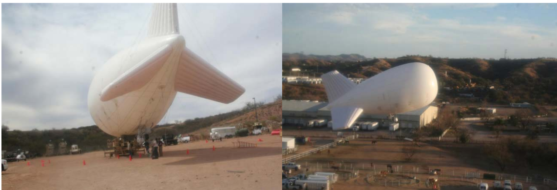
Figure 5. 75-foot Raven Corporation aerostat over the Nogales Border Patrol Station

surveillance systems from L3 Communications-Wescam, and Logos Technology, which according to the manufacturers could range 9 miles and 4.5 miles respectively and are similar to systems currently installed on CBP aircraft. Wind appeared the biggest obstacle placing restrictions on when the aerostat could be filled, when it could be launched and when it was to be brought down. Due to winds the initial aloft schedule was adjusted resulting in a period where the aerostat remained in the air at 2000 feet altitude, for 48 hours straight. During the five day trial, over 100 apprehensions were made in the surrounding terrain directly attributable to this platform.