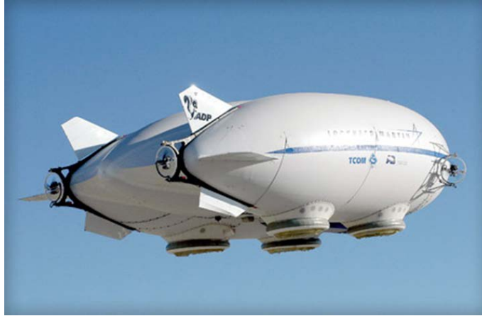
Figure 8. Hybrid Air Vehicle (P-791) Walrus