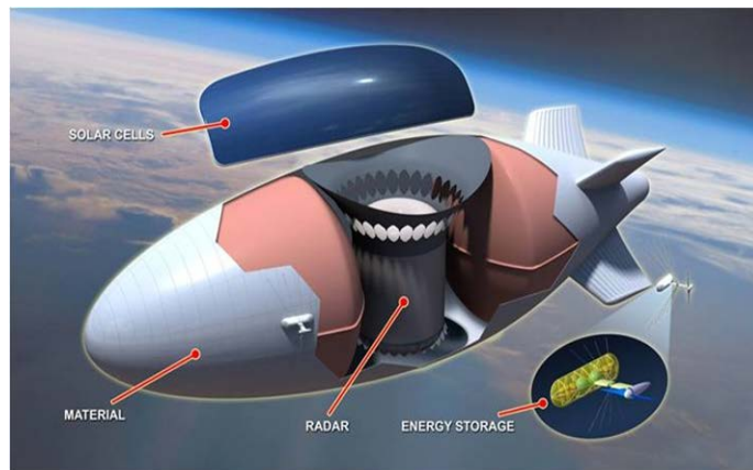
Figure 6. Integrated Sensor Is Structure (ISIS)

January 1, 1980, only two resulted in the death of the pilot. Therefore, when properly equipped, dirigibles are feasible for use by CBP. Moreover, because they are significantly safer than fixed and rotary winged aircraft, dirigibles are an acceptable platform for CBP surveillance. Lastly, because they will serve in a similar capacity as CBP fixed and rotary wing aircraft, dirigibles meet the criteria of suitability.