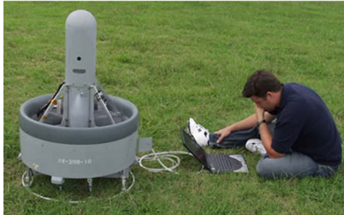
Figure 9. Organic Air Vehicle (OAV)

missions by conducting, for example, remote monitoring of ports, provide situational awareness during raids or respond to sensor activations along desolate mountain trails. 85