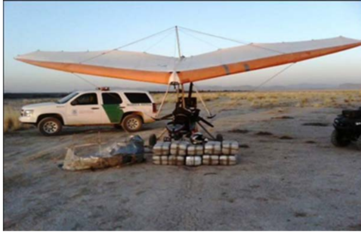
Figure 3. Drug laden ultra-light aircraft