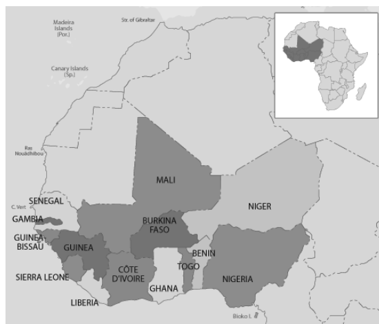
Figure 1: African Development Bank Group - http://www.afdb.org/en/countries/west-africa/

paper, West Africa includes the following countries: Benin, Burkina Faso, Ivory Coast (Cote D'Ivoire), Gambia, Ghana, Guinea, Guinea Bissau, Liberia, Mali, Niger, Nigeria, Senegal, Sierra Leone, and Togo (Figure 1).