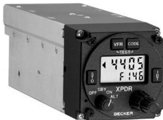
Figure 3: Becker ATC 4401 compact aircraft transponder

This means that all air transits have to be cooperative to register with associated secondary surveillance radar of airports and countries in the region. The secondary surveillance system requires a cooperating transponder on an aircraft to track it. This transponder emits a signal allowing it to be tracked, providing data on altitude and identity. Absent the pilot activating the unit and operating this transponder in the “ON” mode, an SSR cannot track or see the aircraft (Figure 2). This willing partner relationship is critical in the electronic interrogation between ground and aircraft. Although not verifiable, simple deduction would lead to a conclusion that aircraft moving illicit drugs or other illegal cargo fly without the transponder operating.