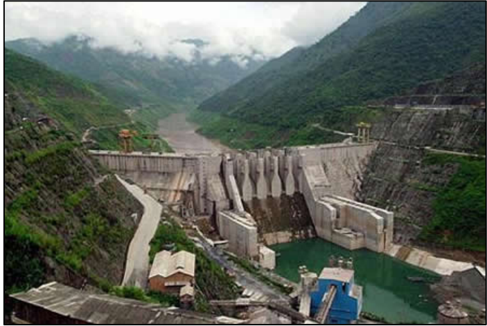
Figure 1: Mekong Dam in China's Yunnan Province

Another recently emerging point of friction between China and Vietnam concerns the Mekong River. Chinese upstream hydropower projects have transformed Southeast Asia's longest river into one of the most sensitive issues in bilateral relations. The river has tremendous hydropower potential and the PRC plans to construct 14 dams to harness this energy source. 47 As of late 2010, four of the dams were completed and another four were under construction.