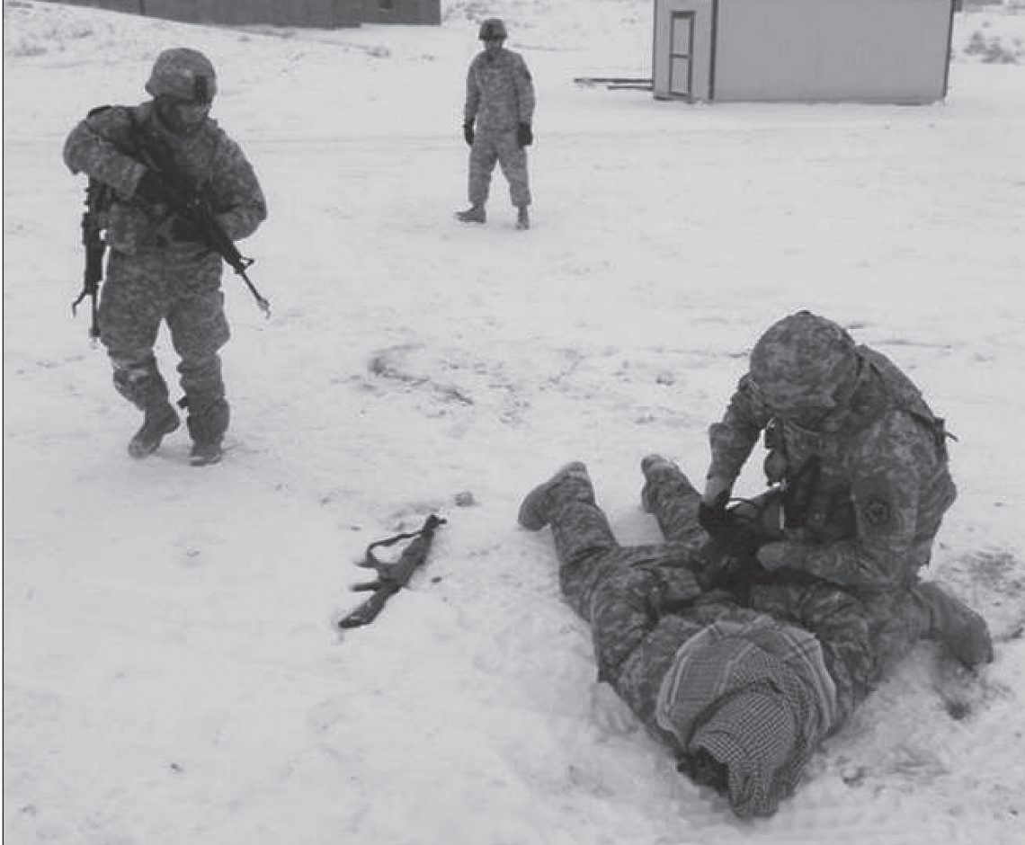
During a 48-hour squad stakes exercise, Soldiers detain a suspect while an evaluator looks on.

Leaders select the type and technique of rehearsals and are most effective when they combine and integrate them into their timeline.