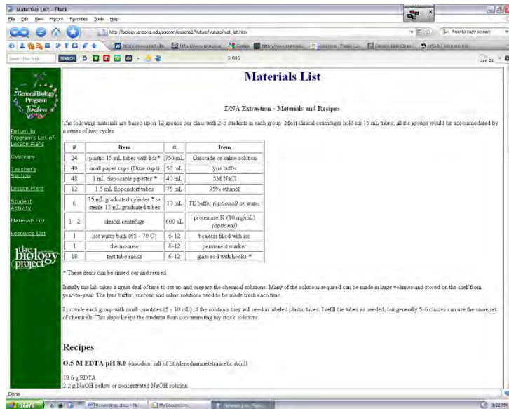
Figure 1. Materials List For DNA Extraction 51

information and examples of how easily materials and equipment can be accessed through the internet.