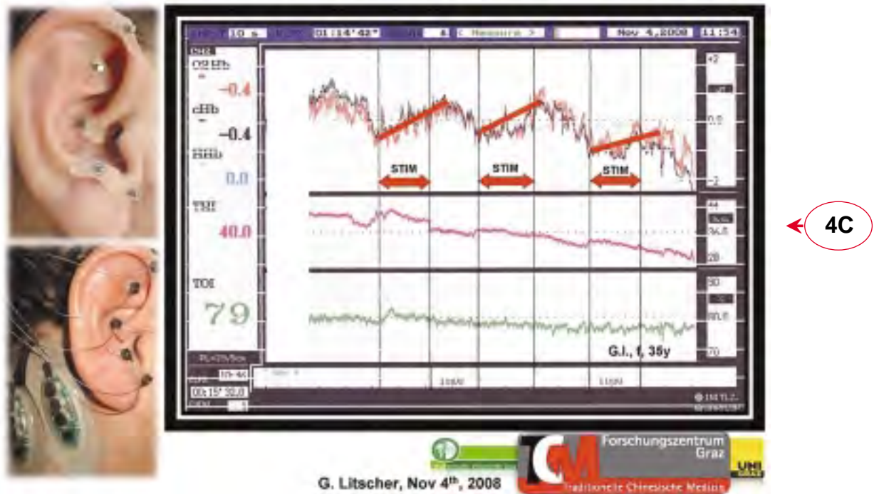
FIG. 3. Near-infrared spectroscopic measurements during electrical stimulation of battlefield acupuncture points in a 35-year-old female volunteer. Observe the reproducible increase in oxyhemoglobin ( O_2Hb ) during electrical stimulation with a frequency of 1 Hz cHb indicates total hemoglobin; HHb, deoxyhemoglobin; THI, tissue hemoglobin index; TOI, tissue oxygenation index.