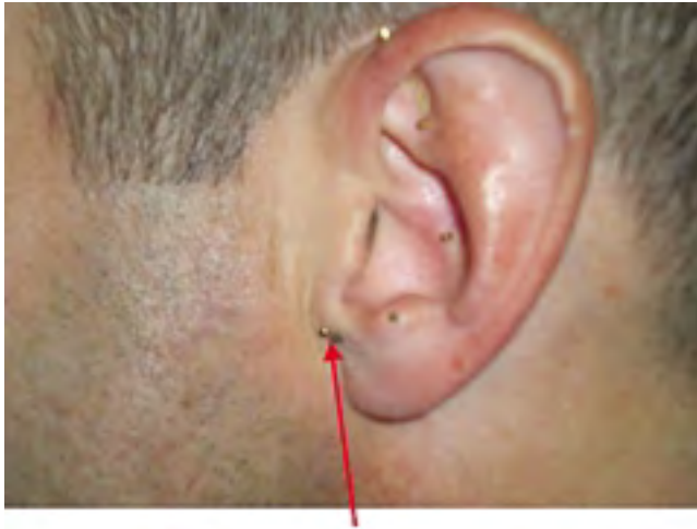
FIG. 1. Arrow delineates 1 gold and 1 stainless steel ASP needle just touching each other at the Cingulate Gyrus Zone.

Niemtzow postulates from observations that the addition of a second ASP needle of a dissimilar metal (stainless steel or silver) just touching the gold ASP needle will produce a small ionic current flow. This system may act like a micro-electrical stimulator to the “acu-zone” (Figure 1).