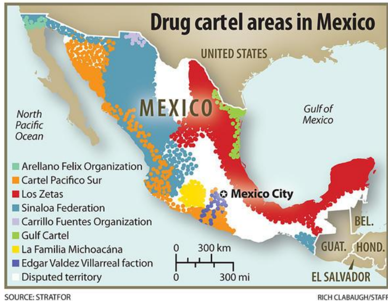
Figure 1. Drug cartel areas of influence.