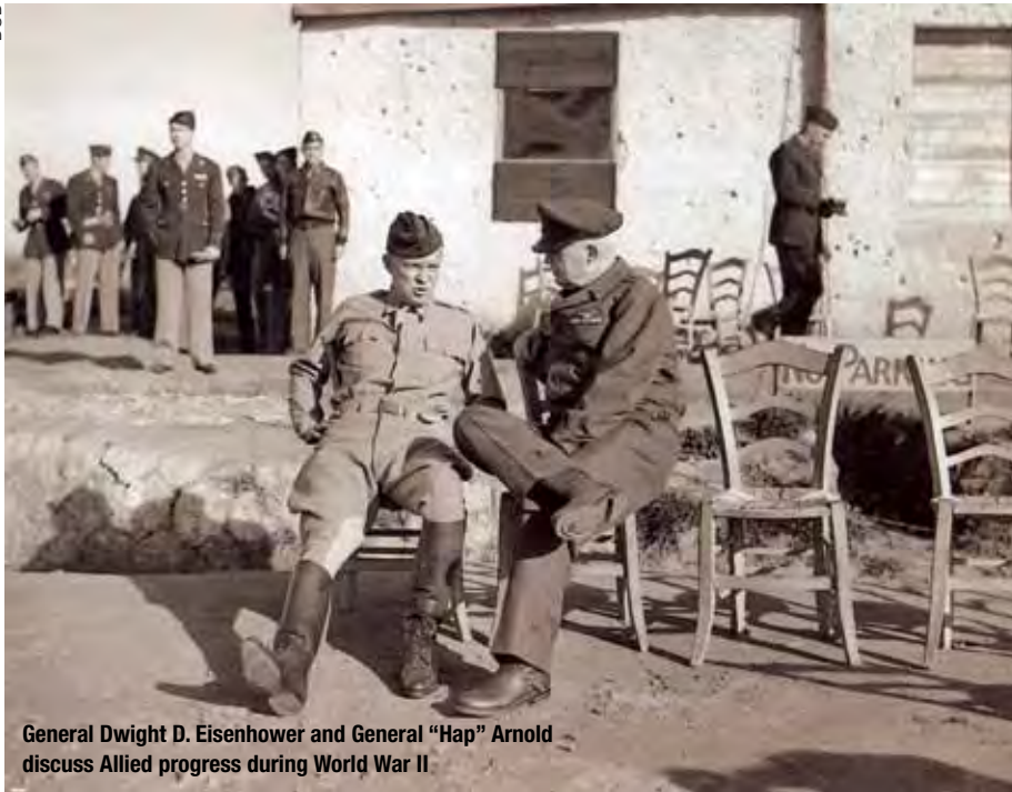
General Dwight D. Eisenhower and General "Hap" Arnold discuss Allied progress during World War II