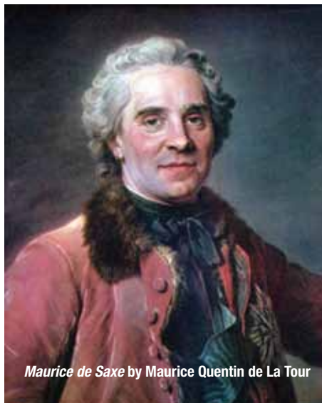
Maurice de Saxe by Maurice Quentin de La Tour