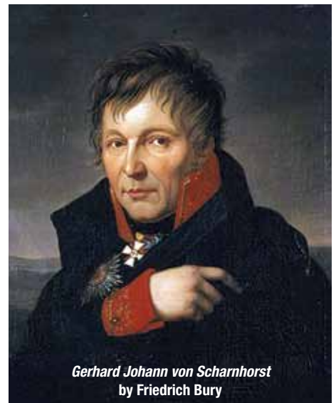
Gerhard Johann von Scharnhorst by Friedrich Bury