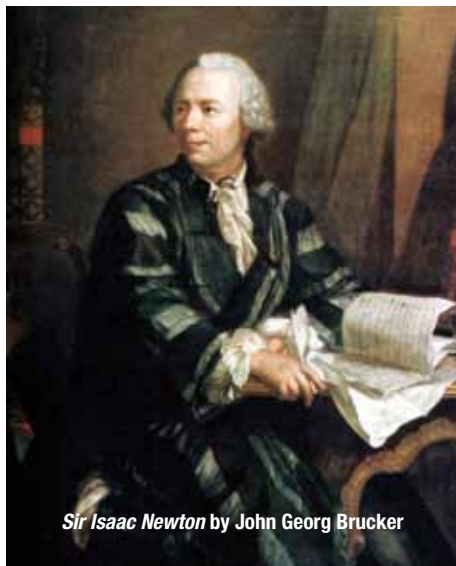
Sir Isaac Newton by John Georg Brucker

J.F.C. Fuller was greatly influenced by well-known philosopher and Darwinian Herbert Spencer. He wrote The Foundations of the Science of War and The Reformation of War in response to what he saw as a failure of military theory in World War I. 23 Spencer's vision of an orderly, deterministic universe led Fuller to think that war is a