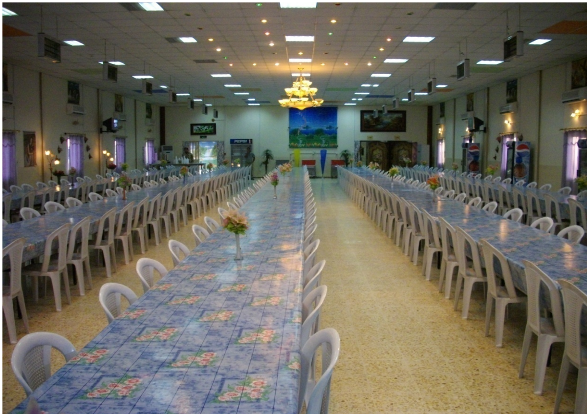
Figure 2—Area IV Dining Facility

The dining facility was modern, and in an excellent state of repair. The kitchen was large, well ordered and clean with two large walk-in freezer/refrigerators: one for meat, and one for vegetables. Although electricity to the camp is still somewhat intermittent, the freezers had their own generators and constant power. Figure 2 shows the Area IV Dining Facility.