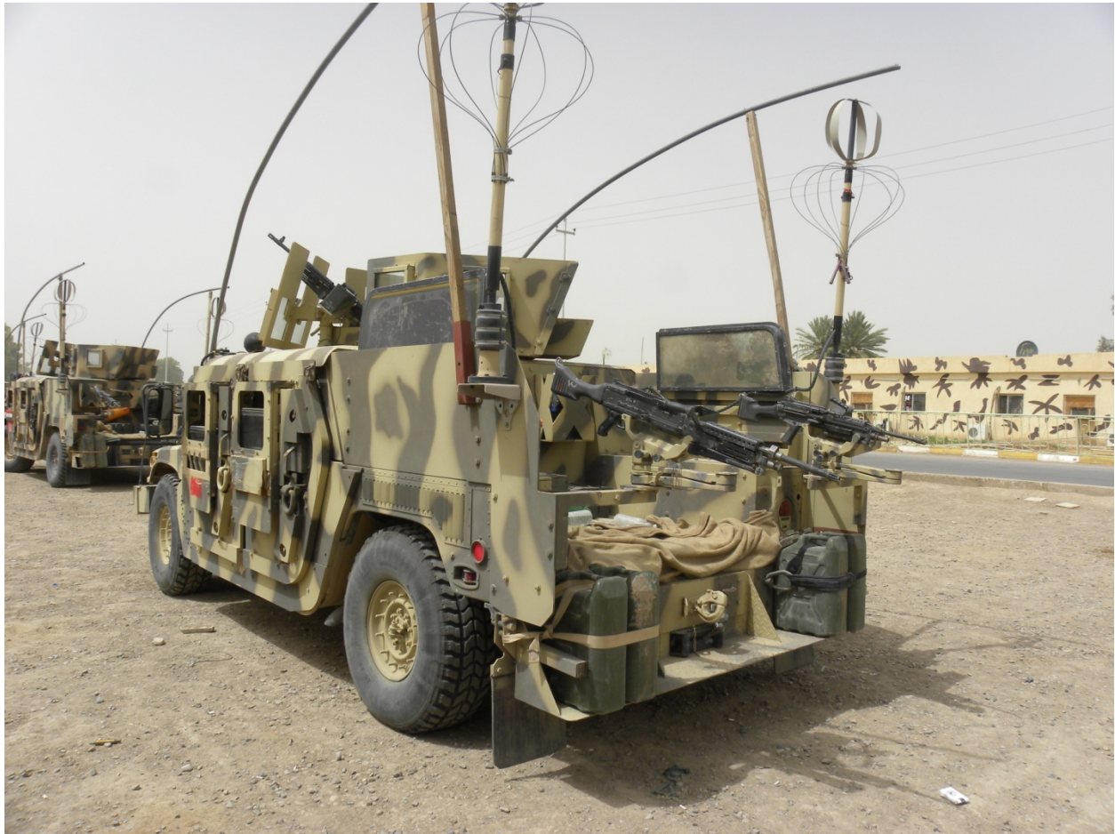
Figure 7—Modified HMMWVs