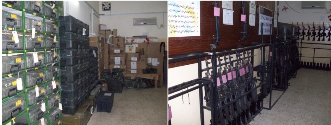
Figure 6—Night Vision Device Storage Room and Arms Room

General report. 3 These storage rooms for night vision devices and weapons are shown in Figure 6.