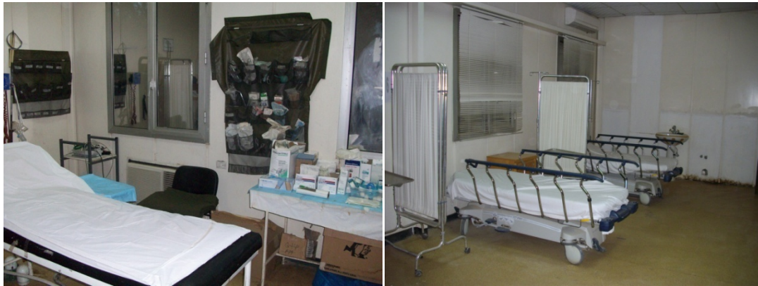
Figure 3—Area IV Medical Examination Room and Ward

The medical facility is staffed with both Medical Doctors and Dentists and has rooms for diagnosis, routine examinations, physical therapy, x-rays, emergent/trauma care, a laboratory, and pharmacy. It can also keep patients overnight in a six-bed ward. The dental facility is located in the same building and contains modern equipment for most dental procedures. These facilities are shown in Figures 3 and 4.