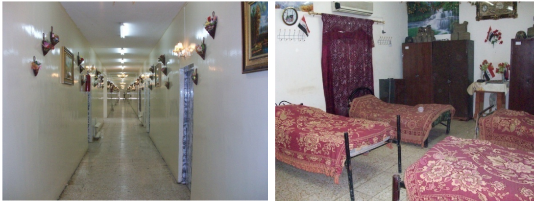
Figure 1—Area IV Barracks