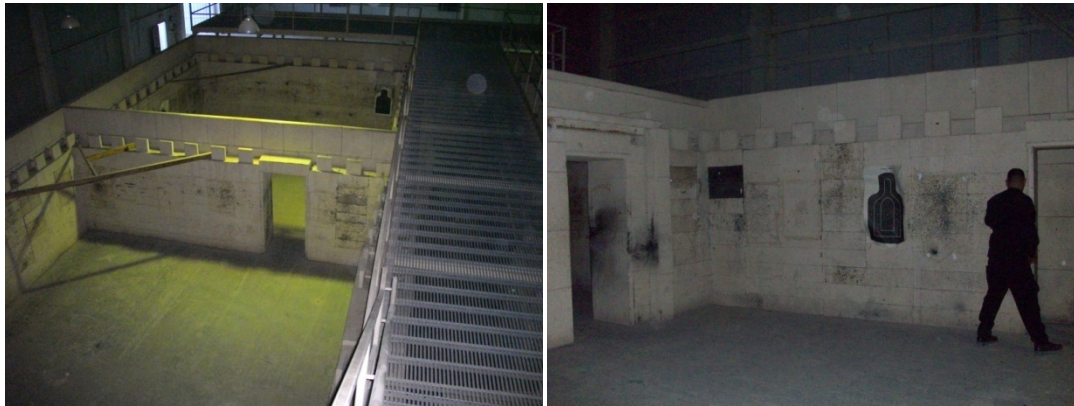
Figure 5—Shoot House Overhead View and Interior Room

The Shoot House is an indoor firing range built at a cost of $2.5 million that allows the ISOF to train in a variety of scenarios. It can be used for live-fire and building-clearing exercises to include the actual “breaching” or entering of the building using explosives, and to allow ISOF soldiers to practice clearing a building using live ammunition. The configuration of the rooms can be modified by closing off some rooms and opening others using special sliding doors. It also permits ISOF soldiers to practice negotiating hallways and stairways; traditionally considered to be danger areas. The Shoot House is shown in Figure 5.