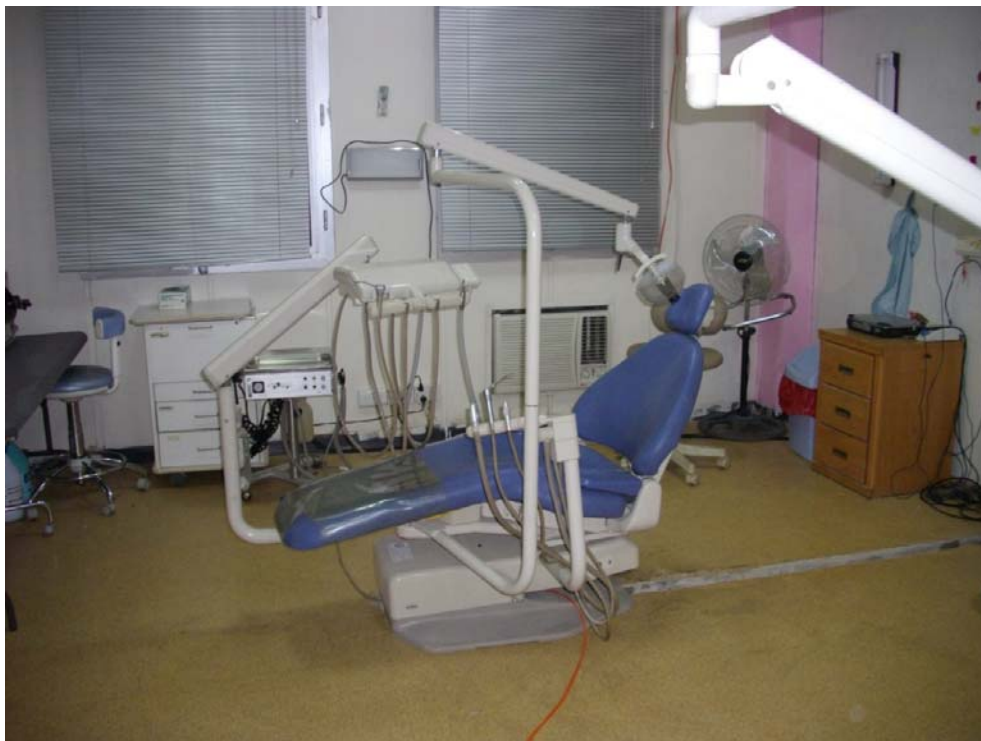
Figure 4—Area IV Dental Facility