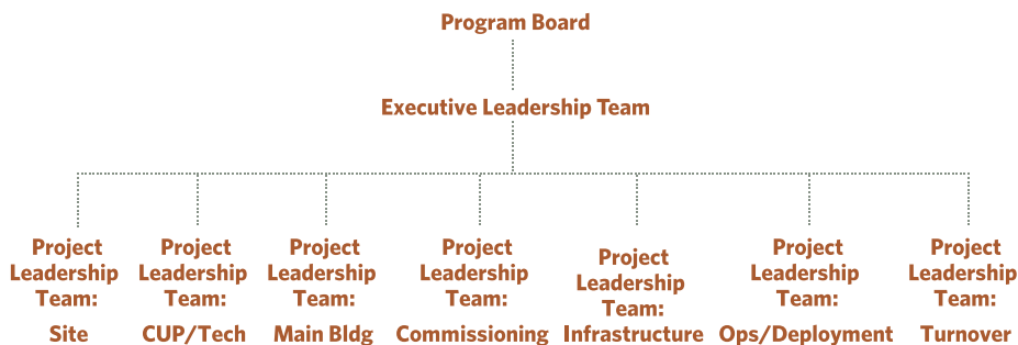
FIGURE 3. NCE GOVERNANCE STRUCTURE

PLTs meet on a weekly basis (or more frequently depending on emergent issues), the ELT meets biweekly, and the PB meets once a month. Each PLT has its own decision space and authority. So long as the PLT’s decisions do not adversely impact another program element, perturb a program-level milestone, or exceed their budget authority, they can directly manage their project’s effort. Activities that may adversely impact other program elements, or are outside the PLT’s decision space, are elevated to the ELT (or PB if necessary) for resolution (NGA, 2009b).