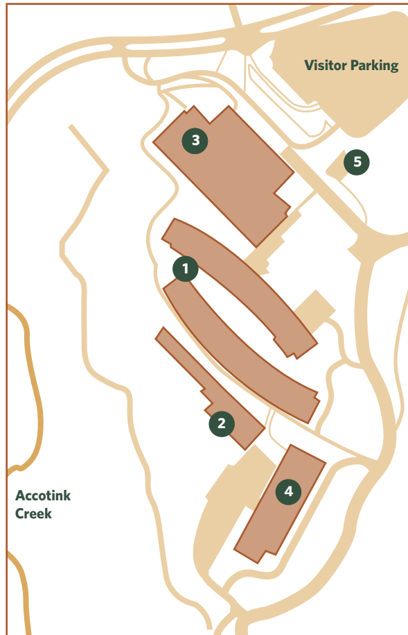
FIGURE 1. NGA CONSOLIDATION

is approximately 89,000 gsf and houses the utility services that are distributed to the campus facilities. The TC (structure “2”) is a 4-story structure roughly 140,000 gsf in size. The Garage (structure “3”) is a 6-level pre-cast concrete structure providing 5,100 parking spaces (in compliance with the National Capital Planning Commission guidelines). The VCC (structure “5”) is an 8,300 gsf facility located on the campus perimeter and allowing access control over visitors. The RIF (not depicted in Figure 1) is a separate 10,000 gsf structure located adjacent to a main access point to FBNA; it allows for security screenings of all inbound deliveries to the NCE.