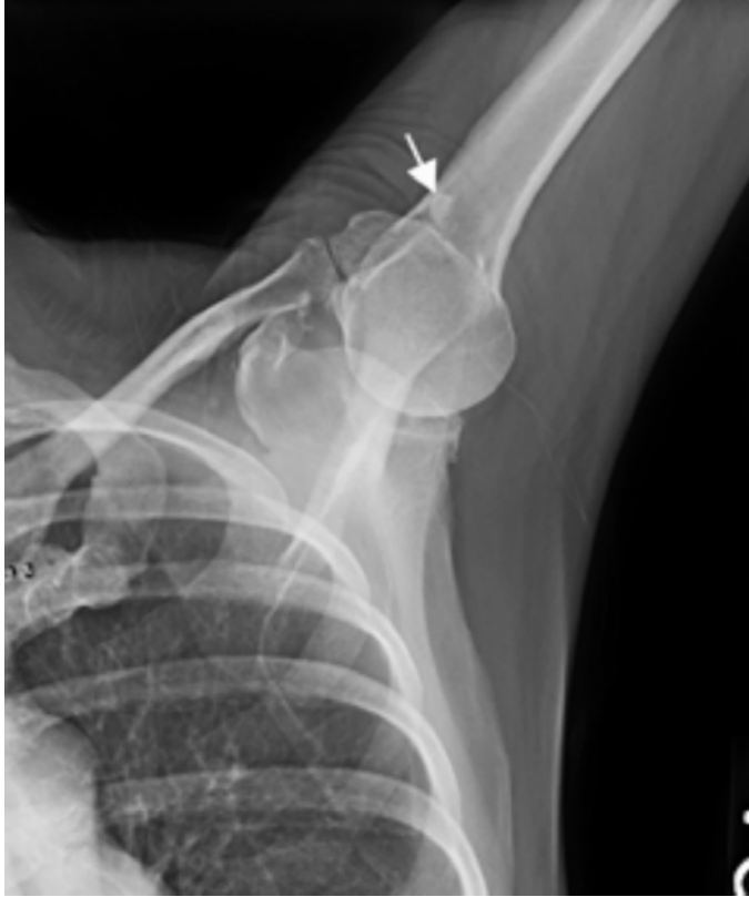
Fig. 1 (B). AP radiograph of the abducted right shoulder demonstrates a well-defined calcified deposit near the more posterior aspect of the greater tuberosity of the humerus (arrow), which is consistent with infraspinatus and teres minor involvement.