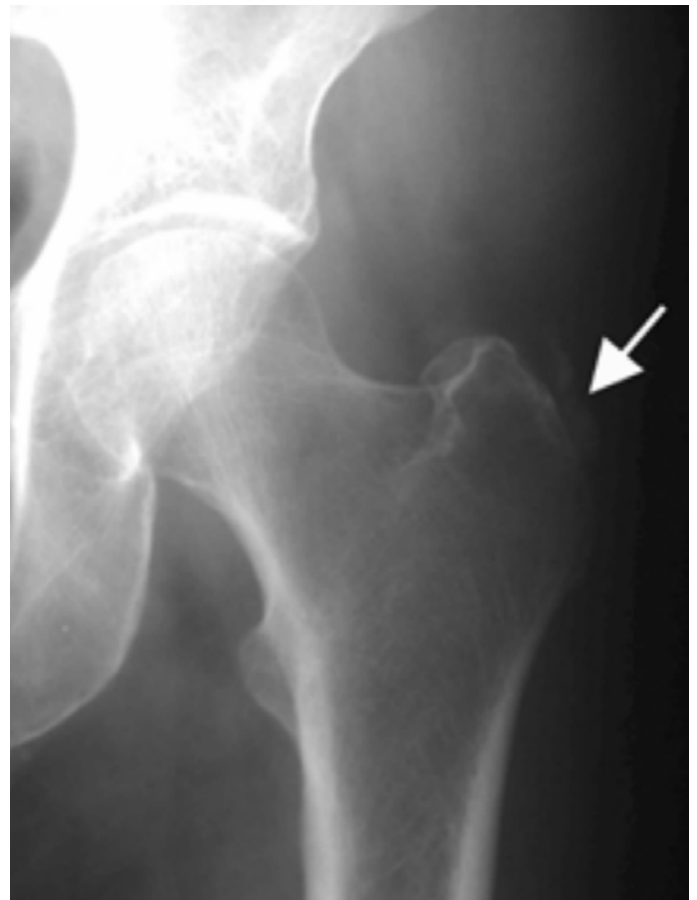
Fig. 2 (A). Routine AP radiograph of the left hip demonstrate a calcific deposit adjacent to the greater trochanter of the femur (arrow).

idea that decreased vascularity and preexisting tissue degeneration might be involved (5). In 1951, Pederson and Key postulated that local necrosis with changes in pH could lead to abnormal hydroxyapatite deposition (6). This correlated with the observation of a critical zone of hypovascularity located in the supraspinatus tendon approximately 1 cm proximal to its insertion on the greater tuberosity of the humerus, which is the most common site of HADD (7). Trauma was implicated by Gondos's observation that incidence of calcific periarthritis around a joint was directly related to its physiologic range of motion (8). Others believe that a metabolic disturbance may contribute to HADD and cite familial cases and associations with certain human lymphocyte antigen factors as evidence (1). To date, the precise pathophysiology of HADD remains unclear.