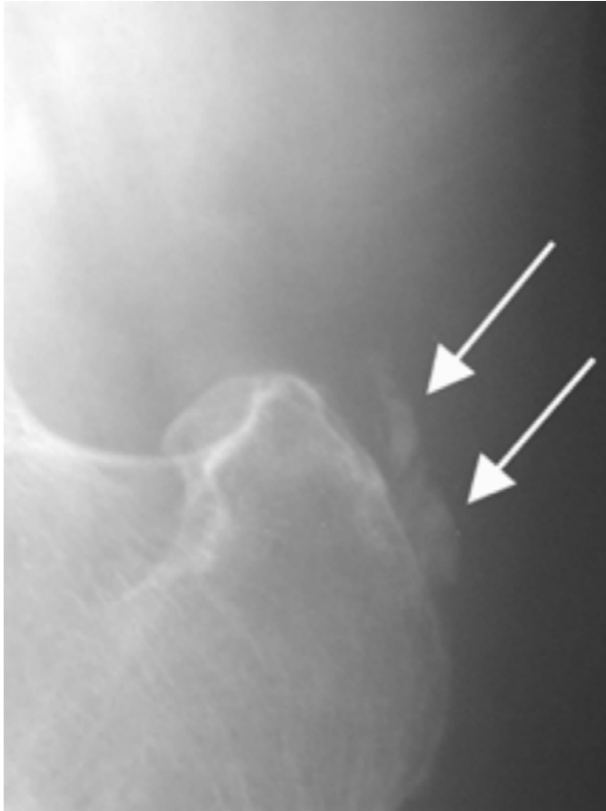
Fig. 2 (B). Magnified AP of the left hip better demonstrate the calcific deposit adjacent to the greater trochanter of the femur (arrows). This is consistent with HADD within the distal portion of the gluteus medius tendon.

phase, the calcification remains within the tendon, but has enlarged and liquefied. The deposit may eventually rupture with subbursal or intrabursal extravasion of the calcified substance. This is believed to cause an acute inflammatory reaction that corresponds to the acute painful attack experienced by the patient.