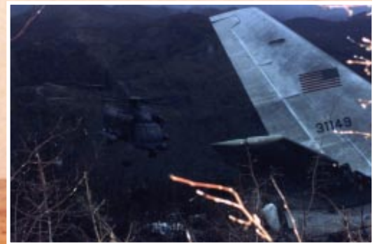
MH-53J approaching crash site near Dubrovnik, Croatia.