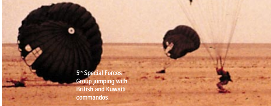
5 th Special Forces Group jumping with British and Kuwaiti commandos.