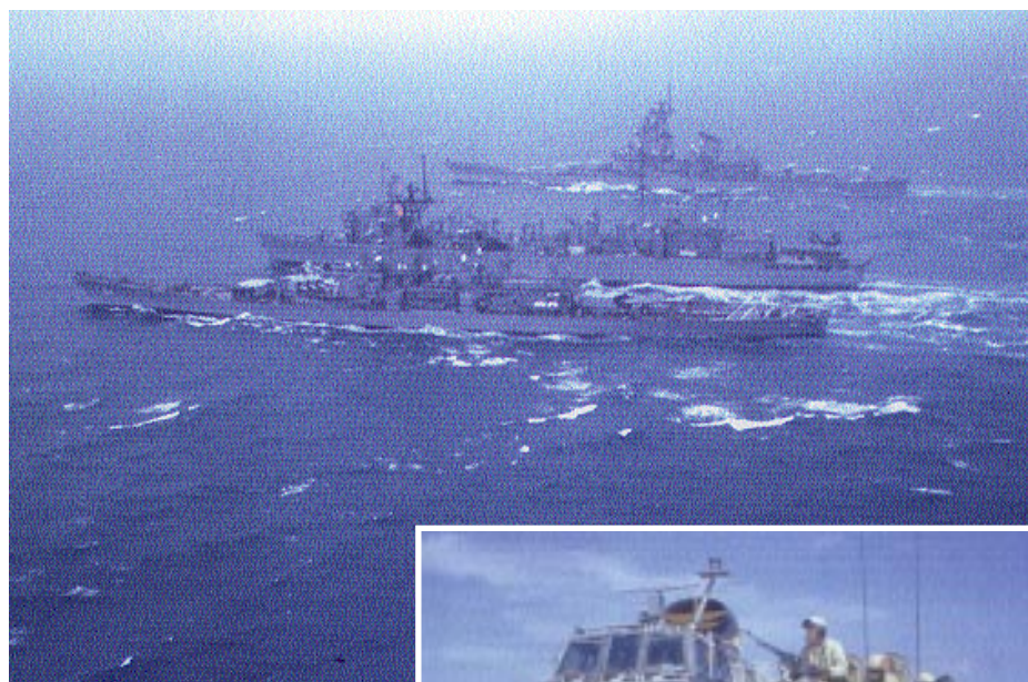
U.S. Navy (John Kristoffersen)

A third advantage of deliberate planning, sometimes considered a disadvantage by planning staffs, is the preparation of a multitude of associated JOPES annexes and appendices. This forces planners to develop "how to" documents at combatant command level for specific combat support functions that are handled as routine operating procedures at tactical level. An example is logistics. At tactical level units rely on standing operating procedures (SOPs) for logistic support functions and simply refer to those SOPs in OPORDs. Tactical air control, medical evacuation, command, and signal are other examples. Despite joint doctrine, joint staffs do not have SOPs for these types of theater support operations. Preparing annexes and appendices compels a staff to find the ways to accomplish these aspects of joint warfighting that would be almost impossible to develop in a timely fashion during a crisis.