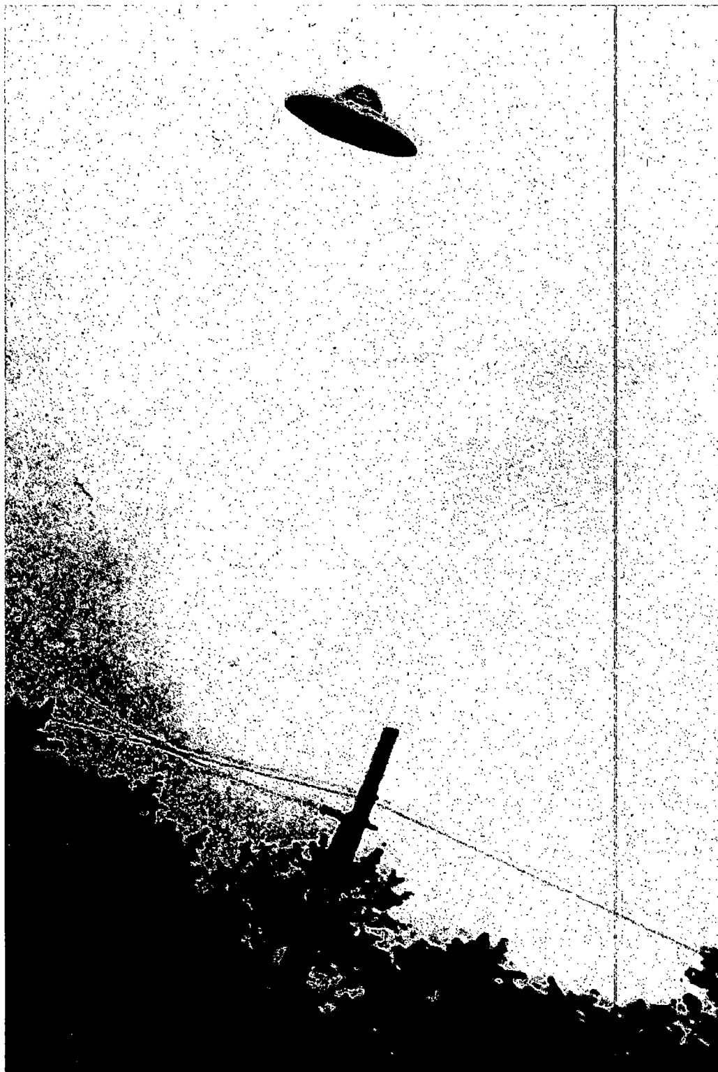
Passoria, New Jersey, 31 July 1952