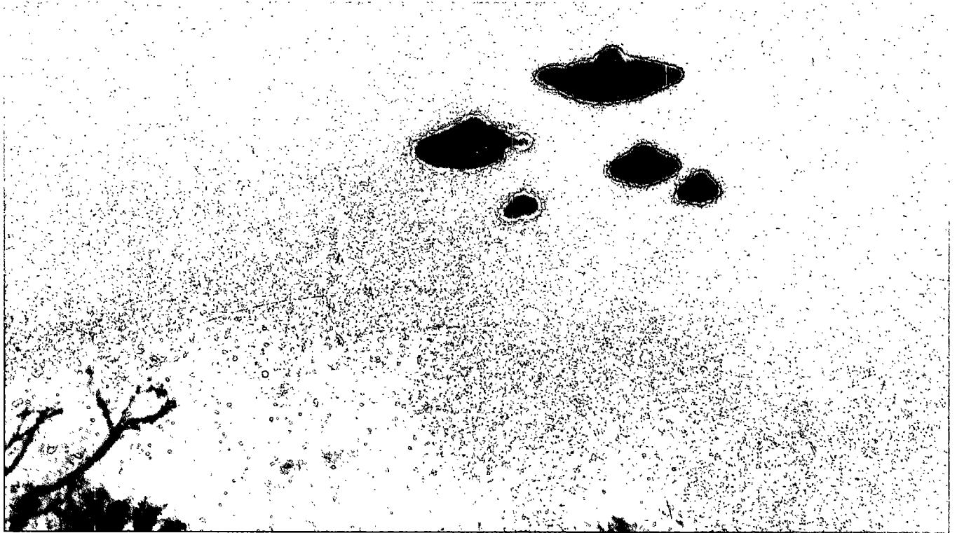
Sheffield, England, 4 March 1962