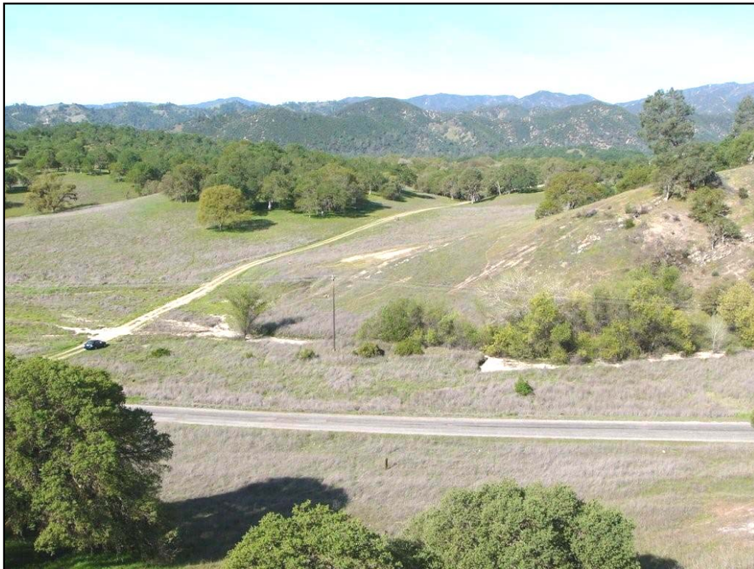
Figure 2. Overview of the site at Fort Hunter Liggett where 19 plots were set up to evaluate the biocontrol fungus, Puccinia jaceae var. solstitialis , March 2008.

In March 2008, 19 permanent 1-m × 1-m plots marked by wooden stakes were installed at Fort Hunter Liggett. Sixteen plots were located with different aspects on hillsides facing northeast and northwest to provide potentially different microclimates (Figure 2), plus three plots were placed in a low-lying area along a creek bed that might hold moisture longer. The inoculum for each plot was prepared by adding 100 mg of urediniospores to 200 ml of deionized water in a 250-ml beaker and adding 2-3 drops of Tween 20. The spore mixture was agitated for approximately 2 min to evenly disperse and wet the spores and then filtered through cheesecloth into a finger pump sprayer. The urediniospores were sprayed evenly over the plots to run off. Following application the plots were covered with 1-m 2 “dew tents” made of PVC pipe and black plastic to conserve moisture and promote infection of the rust. The tents remained in place overnight and were removed the following morning.