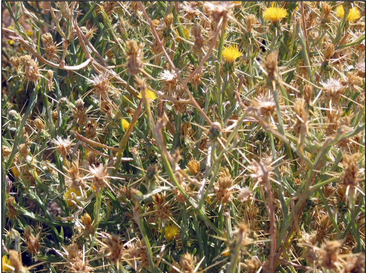
Figure 1. A yellow starthistle infestation at Fort Hunter Liggett, CA. Note the spines on the seed heads.

PURPOSE: This technical note describes the results of a field study conducted to evaluate the effectiveness of the rust fungus, Puccinia jaceae var. solstitialis , as a biological control agent for management of yellow starthistle, Centaurea solstitialis L., at Fort Hunter Liggett, an Army training installation in California (Figure 1).