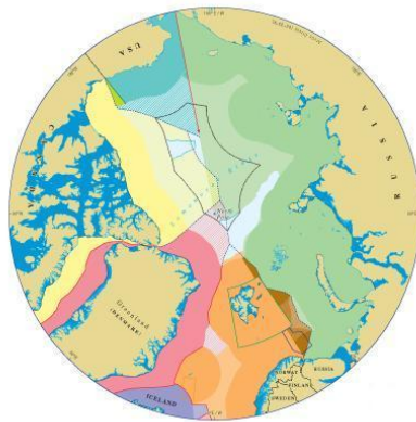
Figure 2: Maritime Jurisdiction and Boundaries in the Arctic Region 8

Obviously, the CCDRs do not have to wait for published policy and guidance to begin research and planning. Executing the above listed tasks off the Alaska coastline within a limited focus on U.S. interests is not so complicated. However, the U.S. is pledged to cooperate with and protect our allies and partners. For this reason, it is imperative that the U.S. engage with the other Arctic nations in resolving boundary disputes, potential continental shelf claims, and establishing a maritime presence, especially for SAR, environmental protection, and homeland defense. Figure 2 shows the various boundaries, territorial waters, claims to the continental shelf, and international straits. The color codes