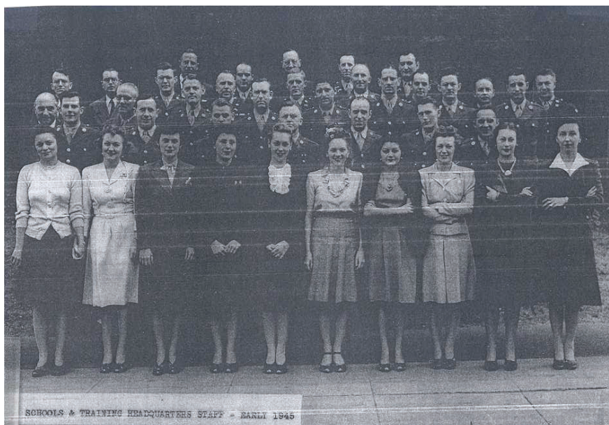
Schools and Training headquarters team, at its peak size, in early 1945.

OSS direct action training had its strengths and weaknesses; the latter, as even the Schools and Training Branch acknowledged, had been particularly evident in the early stages of its evolution. Until combat veterans began to return in the fall of 1944, few of the stateside instructors had any opera-