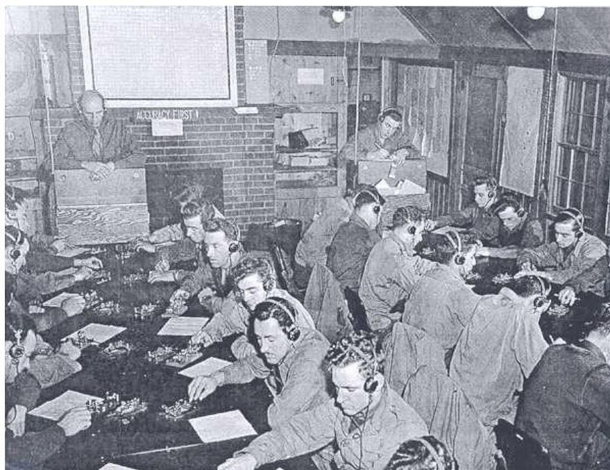
Communications school class in coded telegraphy at Training Area C.

Area E, two country estates and a former private school about 30 miles north of Baltimore, was created in November 1942 to provide basic Secret Intelligence and later X-2 training—as a result, RTU-11 became the advanced SI school. Area E could handle about 150 trainees. When the Morale Operations Branch was established to deal in disinformation or psychological warfare, “black” propaganda, men and women of the MO Branch also trained at Area E, although men from MO, SI, and X-2 often received their paramilitary training in the national parks. 30