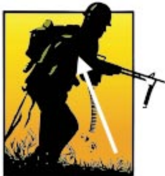
FIGURE 4 A MOVING SOLDIER'S CoG

center of gravity, the same is true in war. The armed forces of every combatant, whether an individual state or an alliance of states, have a certain unity and thus a certain interdependence or connectivity [ Zusammenhang ]; and just where such interdependence exists, one can apply the center of gravity concept. Accordingly, there exist within these armed forces certain centers of gravity that, by their movement and direction, exert a decisive influence over all other points; and these centers of gravity exist where the forces are most concentrated. However, just as in the world of inanimate bodies where the effect on a center of gravity has its proportions and limits determined by the interdependence of the parts, the same is true in war. 14