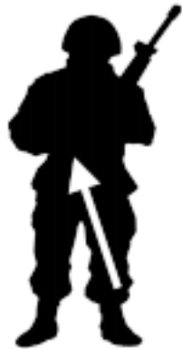
FIGURE 3 A STATIONARY SOLDIER'S CoG

physicist could treat both masses as one and calculate a common center of gravity of the total mass; however, if the struggle proceeds at a rapid pace, the CoG will change constantly.