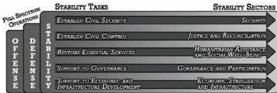
Figure III-1 85

S/CRS’s “Post-Conflict Reconstruction Essential Tasks” was exceptional in that it was the first S/CRS document to explicitly address psychological reconciliation methods, such as truth commissions, public outreach programs, ethnic and intercommunity confidence building, and remembrance projects. In May 2007, DoS and USAID published their joint “Strategic Plan: Fiscal Years 2007-2012” which established five strategic goals that clearly correlated with S/CRS’s five stability sectors. 84 In October 2008, the US Army published FM 3-07, Stability Operations , which defined five primary stability tasks for military forces that directly supported S/CRS’s stability sectors. (See Figure III-1)