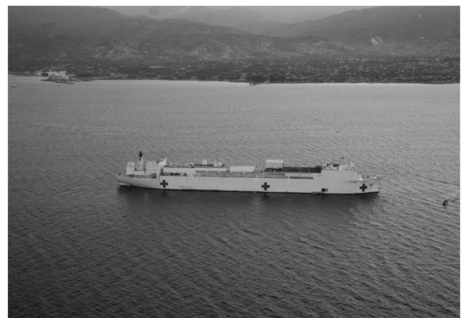
Figure 2. Aerial view of USNS COMFORT in Port-au-Prince harbor.

This article describes the unique situation of a mobile tertiary care hospital responding to a large-scale natural disaster. We do not suggest that tertiary care is required for most injuries occurring during a natural disaster, such as the Haitian earthquake. In disaster medicine, resources focused