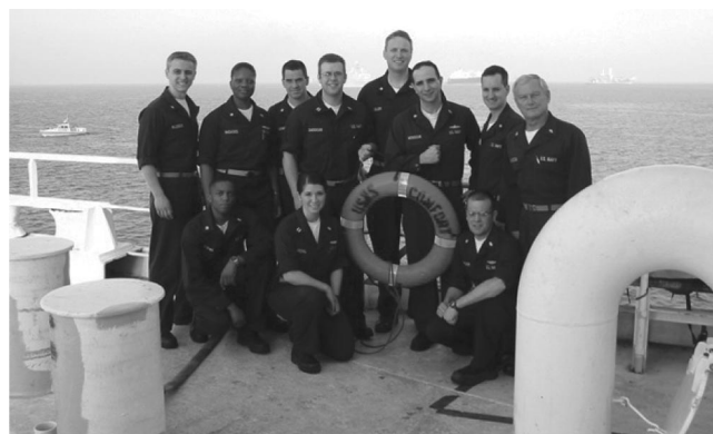
Figure 1. Internal medicine staff of the USNS COMFORT .