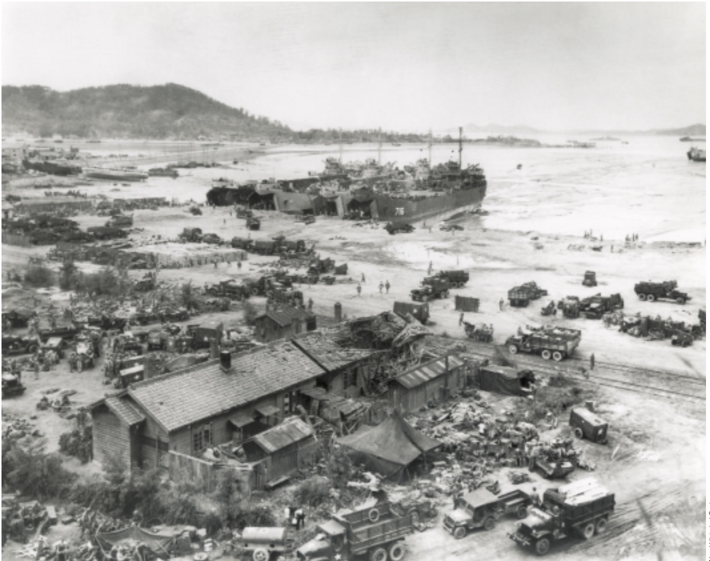
Naval Historical Center