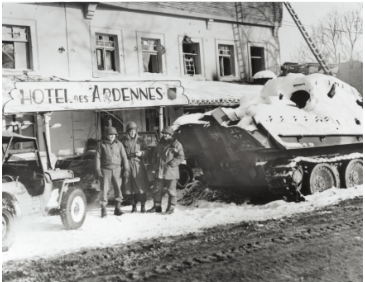
Destroyed German tank outside St. Vith.