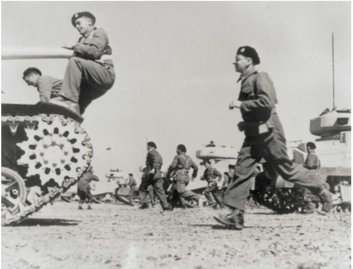
British tank crews in North Africa.