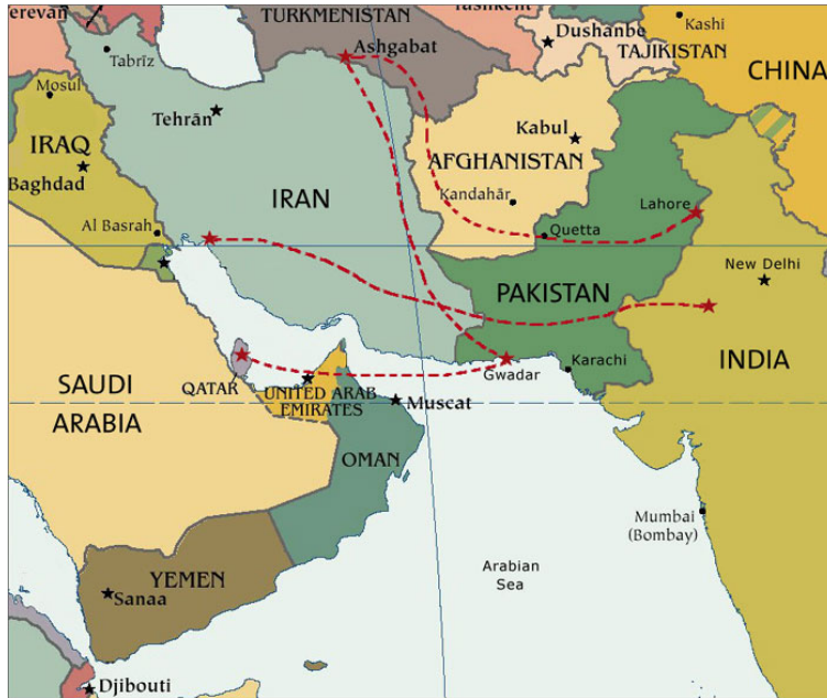
Figure 3. Gwadar's Strategic Location

In response to the development of Gwadar, India is helping Iran with a competing project in Chabahar. India's economic alliance with Iran is in direct response to the economic threat of Gwadar. Chabahar's location, only 120 miles from Gwadar, is astonishingly close. It shares the Gwadar advantages of being outside the Strait of Hormuz and is accessible from Central Asia. India's help in building Chabahar is helping to pave the way for Central Asian access. Although Chabahar is not as developed as Gwadar, it contains significant potential for Iran and India. Additionally, in 2003 the Indian Border Roads Organization announced plans to build a 200-kilometer road that would connect Chabahar to Afghanistan's garland route. 148 India has also forged an economic alliance with Afghanistan. In 2007, India became Afghanistan's fifth largest donor with $750 million in aid given each year. India also took steps to include Afghanistan in the South Asian Association of Regional Cooperation