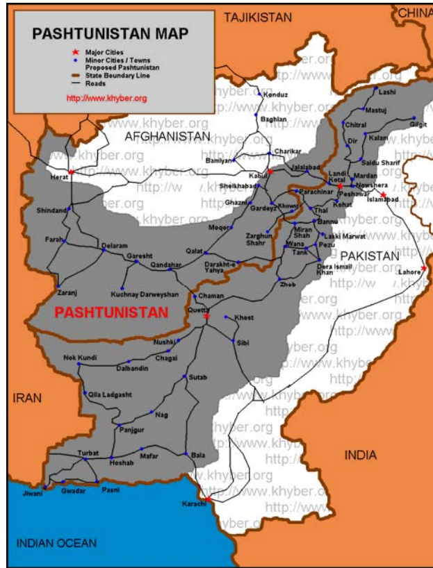
Figure 4. Contemporary interpretation of Pashtunistan

This incorporation of the Baloch territories into Afghanistan links back to the seventeenth century. Ahmad Shah Durrani, then the king of Afghanistan, ruled over the Baloch state of Kalat for fourteen years. 157 Consequently, when Kabul complains about the British-demarcated border between Afghanistan and Pakistan, the Durand Line, it occasionally includes the Baloch as part of their rightful territory. In 1978, the Afghan Prime Minister Hafizullah Amin said that the Durand Line “tore us apart” and that, “we will do our historical duty when the time is right.” As a result of this commitment to the Afghan interpretation of the Afghan-Pakistan border, Amin said that the “Baloch nationalist movement is very dear to us.” 158 Naturally, today the inclusion of the Baloch territories into landlocked Afghanistan would have profound benefits for