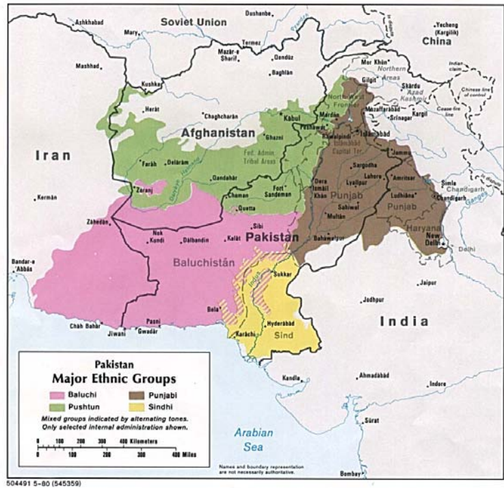
Figure 1. Major Ethnic Groups of Pakistan