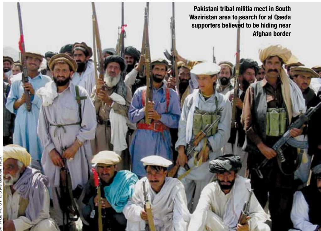
Pakistani tribal militia meet in South Waziristan area to search for al Qaeda supporters believed to be hiding near Afghan border

On December 13, 2001, ISI-sponsored Lashkar-e-Taiba militants attacked India's parliament in New Delhi. When India went to a war footing, Musharraf ordered the arrest of 50 LET members and banned certain militant groups, declaring he would not allow terror-