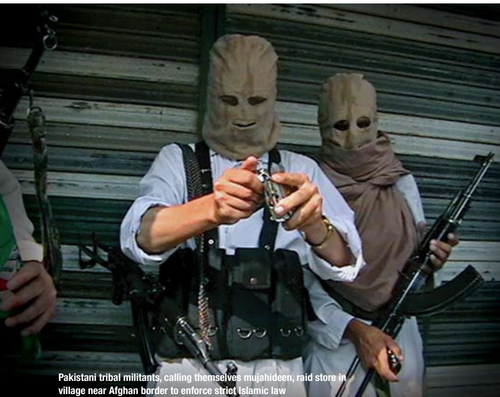
Pakistani tribal militants, calling themselves mujahideen, raid store in village near Afghan border to enforce strict Islamic law

ISI took Saudi money to fund madrasas , which indoctrinated extremists, providing militants to fight India in Kashmir. Madrasas became recruiting and training pipelines whose graduates played key roles in the Taliban and Kashmiri terrorist groups. They