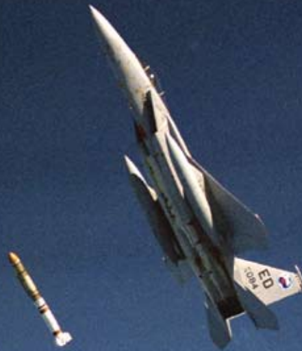
American ASAT is loaded onto F-15

of the National Reconnaissance Office that Chinese lasers have "painted" U.S. satellites indicates a capability to disrupt imaging satellites by dazzling or blinding them. 4 Jamming can disrupt U.S. military communications and global positioning system (GPS) navigation and targeting signals. The exact performance characteristics of Chinese systems are