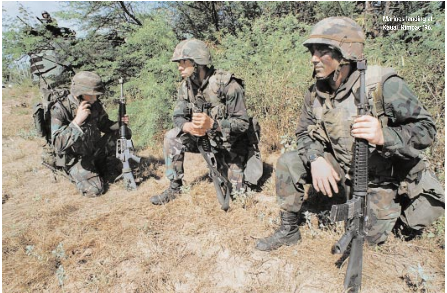
Marines landing at Kauai, Rimpac '96.