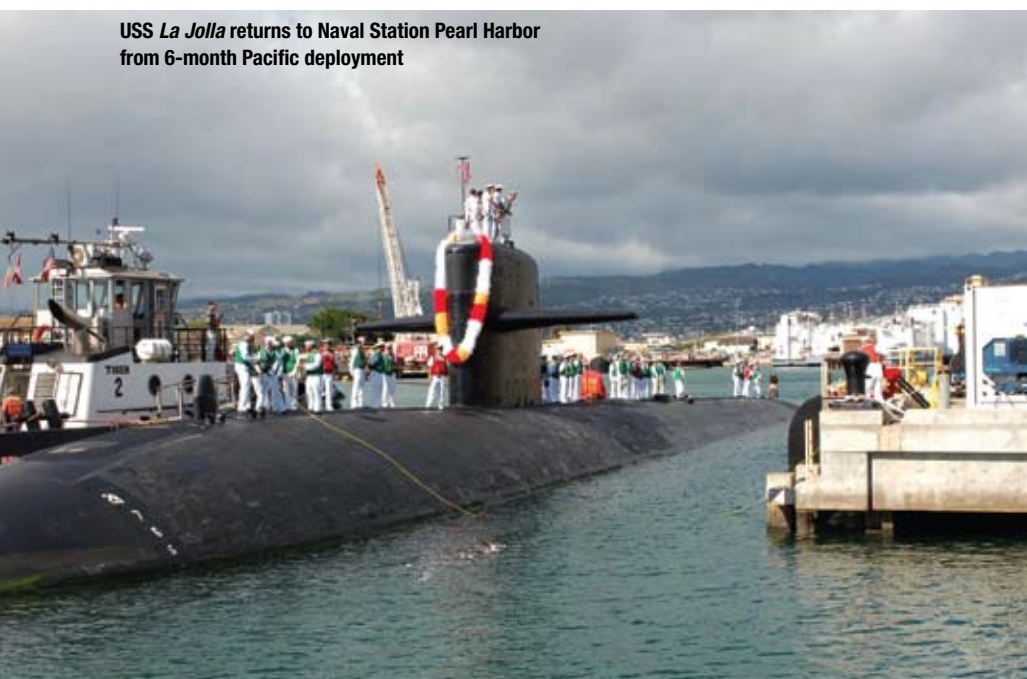
USS La Jolla returns to Naval Station Pearl Harbor from 6-month Pacific deployment

A commander thinks operationally when he possesses an operational rather than tactical perspective in exercising his numerous responsibilities, both in peacetime and in war. In purely spatial terms, the operational perspective encompasses the (formally declared or undeclared) theater of operations plus an arbitrarily defined area of interest. The perspective of a tactical commander is much smaller because he is focused on planning and executing actions aimed at accomplishing tactical objectives in a given combat zone or area of operations. The broadest perspective is required at the military and theater-strategic levels of command. Among other things, the strategic perspective requires the commander's ability to translate objectives of national policy and strategy into achievable military or theater-