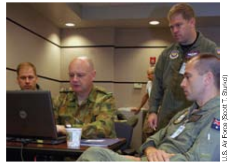
U.S. and Australian officers helping to shape strategic planning in Global Mobility Wargame 2008

nature of war were ignored. Yet U.S. and NATO experiences in the recent conflicts in Afghanistan and Iraq, and the Israeli experience in the second Lebanon war in 2006, have revealed not only serious limitations but also important flaws in the practical application of the systems view of war. These conflicts have shown the timeless value of the Clausewitzian view of warfare. The future might well show that most efforts and resources spent on adopting a systems view of warfare were essentially wasted.