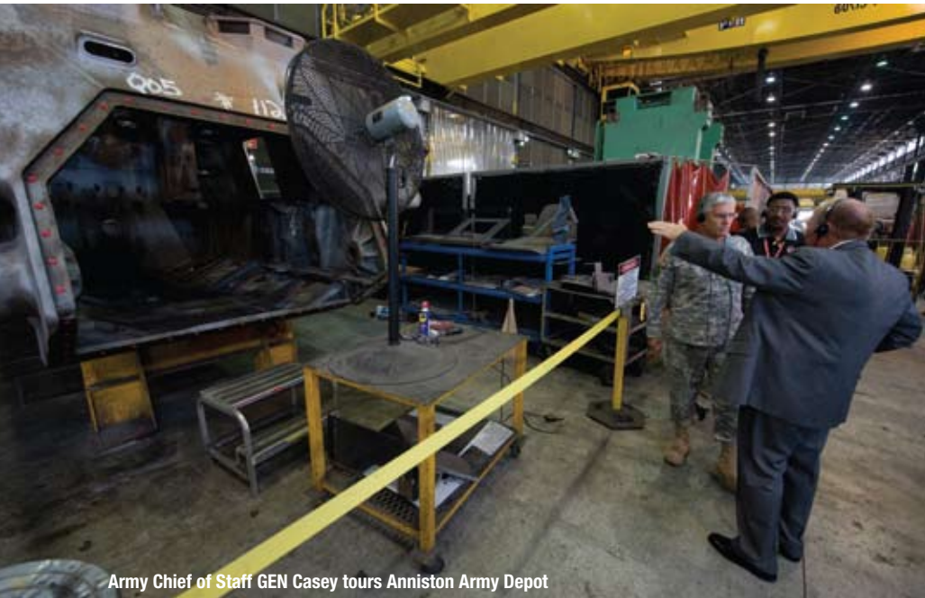
Army Chief of Staff GEN Casey tours Anniston Army Depot

SOD proponents falsely claim that intelligence preparation of the battlefield (IPB) is most suitable for the tactical but not higher levels of war. In their view, IPB deals only with physical reality. Its mechanistic and reductionist processes are more appropriate