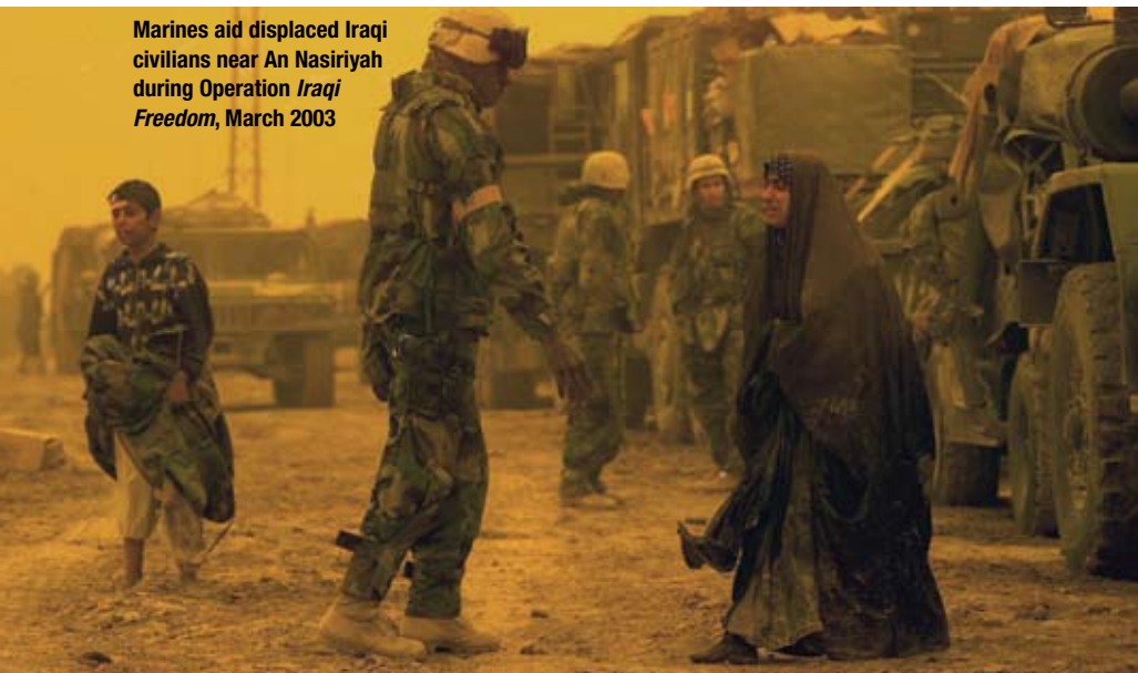
Marines aid displaced Iraqi civilians near An Nasiriyah during Operation Iraqi Freedom, March 2003

DOD recognizes the need for fresh thinking and has begun exploring the nature of this mixed challenge. An ongoing research project, including a series of joint wargaming exercises, has been initiated by the Office of the Secretary of Defense. U.S. Joint Forces Command is exploring the implications as well, and the