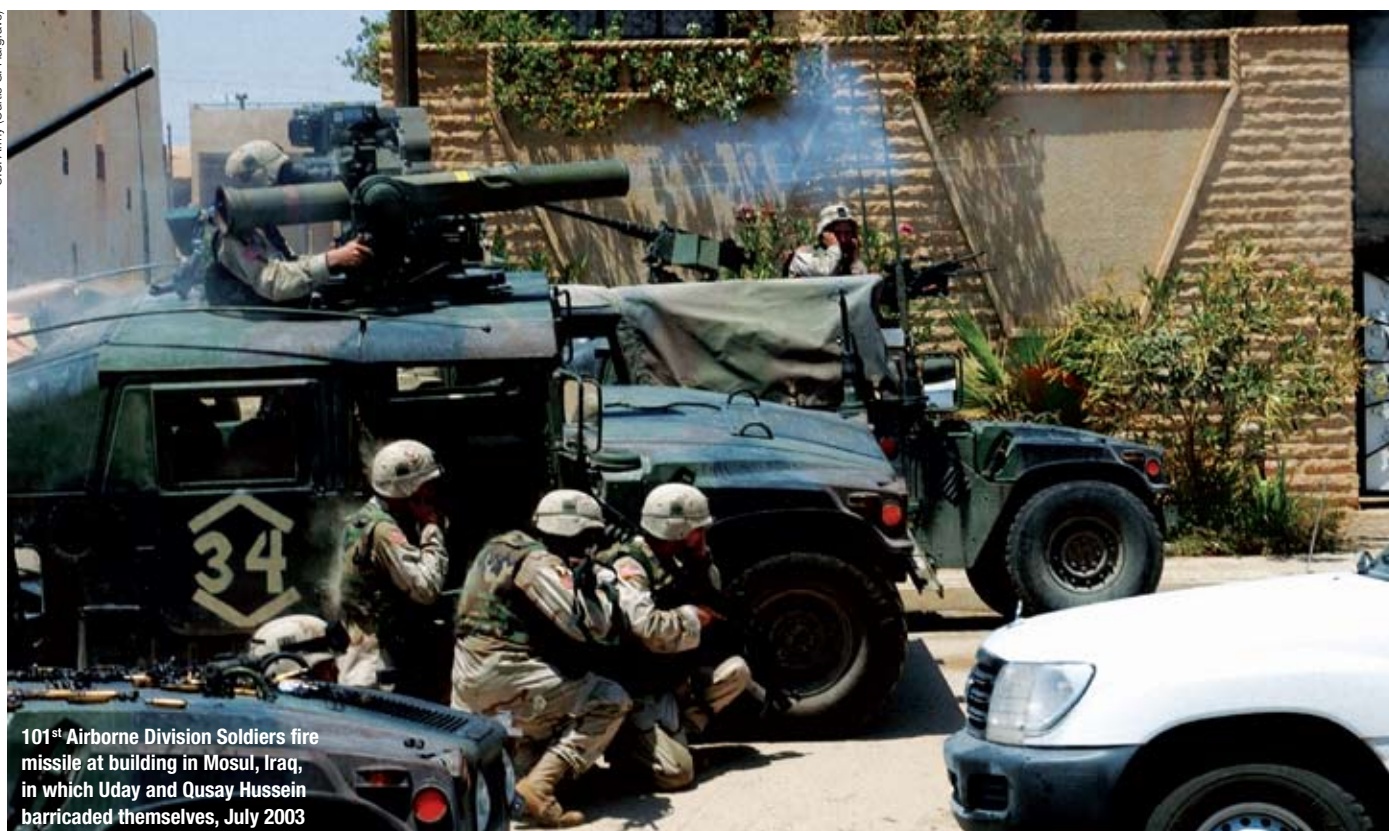
101 st Airborne Division Soldiers fire missile at building in Mosul, Iraq, in which Uday and Qusay Hussein barricaded themselves, July 2003