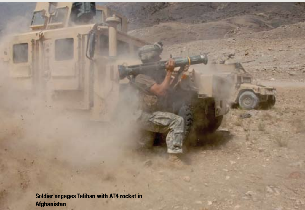
Soldier engages Taliban with AT4 rocket in Afghanistan

Massing ISR in time and space has operational results that should not be ignored. The Office of the Secretary of Defense study concluded that massed and persistent collection was an important element of success in SOF operations. 8 Conventional forces tend to cover disparate targets for a shorter period than SOF, which tend to focus collection on a smaller number of targets for much longer. The conventional force approach reveals a desire to service a large number of targets and units instead of developing the pattern of life of an enemy network. The tendency to think of persistence in terms of space rather than time