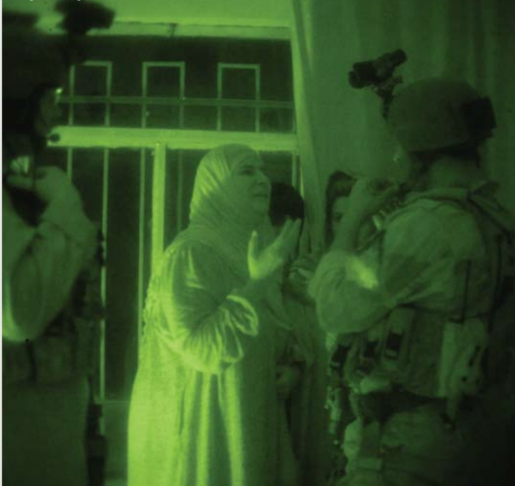
Iraqi special operations forces detain suspected insurgents in Baghdad

all the intelligence disciplines conferred and contributed their part to help the operator decide whether to conduct a raid, call an airstrike, bring in another collection asset, or continue to observe