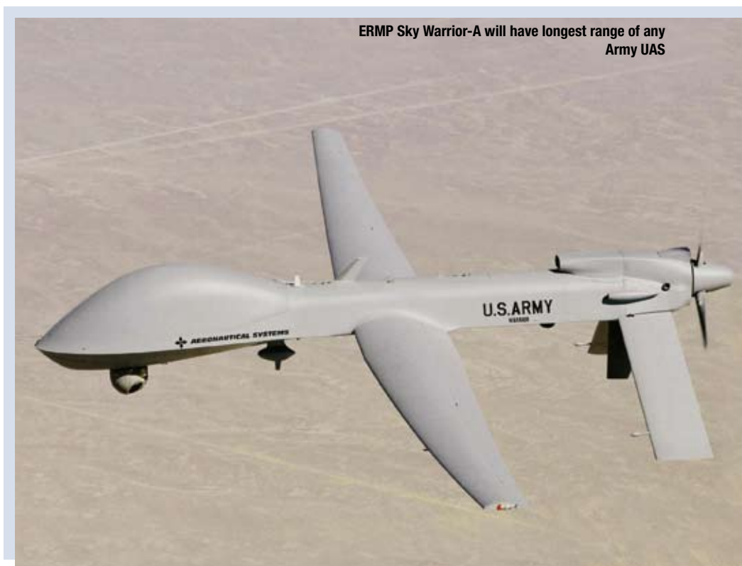
ERMP Sky Warrior-A will have longest range of any Army UAS

the General Atomics Sky Warrior A UAS into Task Force ODIN (Observe, Detect, Identify, Neutralize), an integration of manned/unmanned systems, new technologies, and nonstandard equipment conducting counter-improvised explosive device (C-IED) missions in Iraq. By combining advanced sensors, tactical RSTA, and MUM teaming of UAS, attack and reconnaissance helicopters, and air assault aviation assets, Task Force ODIN has been able to maximize combat power and employ lethal and nonlethal effects to deny the enemy a permissive environment to operate.