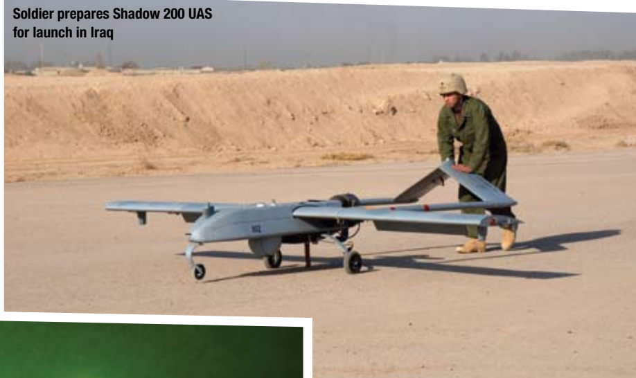
Soldier prepares Shadow 200 UAS for launch in Iraq