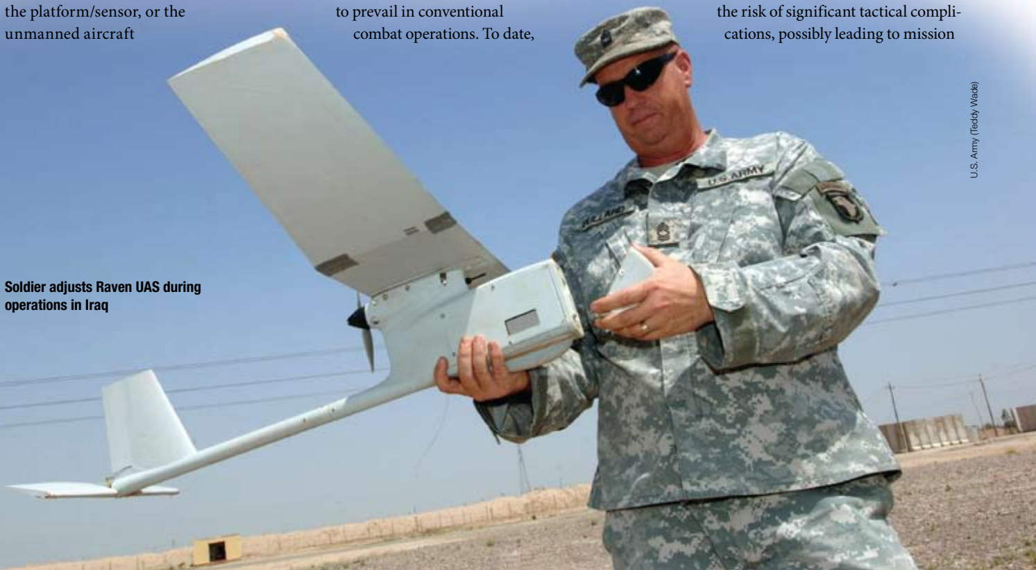
Soldier adjusts Raven UAS during operations in Iraq

In combat operations, the risk to platoons is often measured in seconds or minutes, with complex terrain compounding that risk. As combat echelons increase (platoon-company-battalion and so forth), the risk of significant tactical complications, possibly leading to mission