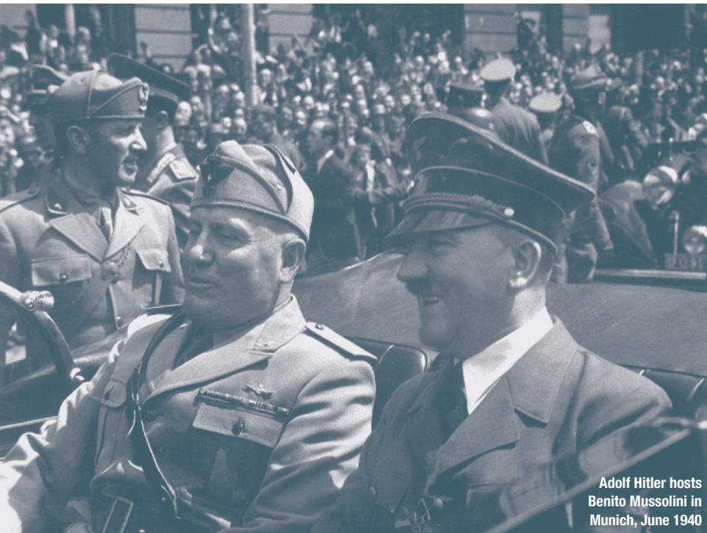
Adolf Hitler hosts Benito Mussolini in Munich, June 1940