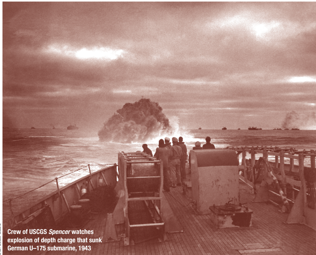
U.S. Coast Guard

By late September 1941, the military planning effort FDR requested began to coalesce in what became known as the Victory Plan. Stimson found the planning process “very educational and very helpful.” 37 The process clearly impacted the estimates held by both Marshall and Stimson. As a result of War Department planning activities, Marshall had continuously revised his own assessment of wartime ground force