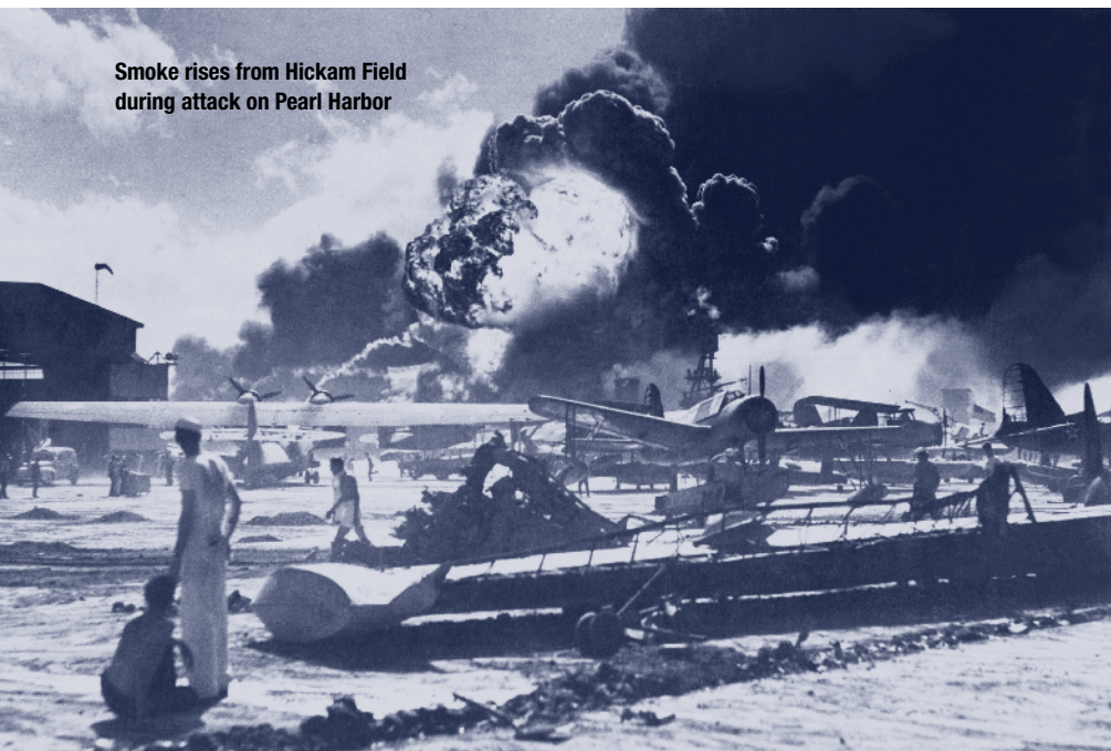
Smoke rises from Hickam Field during attack on Pearl Harbor

With the declaration of war on the United States by Hitler and Benito Mussolini on December 11, Roosevelt's hope of avoiding entry into the war came to an end. 53 Roosevelt informed Congress that German "forces endeavoring to enslave the entire world are now moving towards this hemisphere." The Roosevelt administration, however, interpreted the German declaration of war as an act of desperation by a regime coming apart and hoping to save its grip on power through