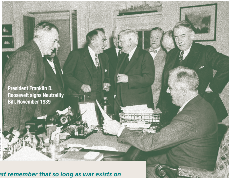
President Franklin D. Roosevelt signs Neutrality Bill, November 1939

in deed but in thought." In 1939, however, FDR rejected Wilson's approach and deemed it "impossible in a situation such as exists in Europe today for a fair-minded people to be neutral in thought." 1 Once war did break out, FDR addressed the American people by radio and, echoing the isolationists, professed that he hated war. He stated, "I hope that the United States will keep out of this war. I believe that it will." At the same time, Roosevelt discounted U.S. military intervention in the European war, announcing, "Let no man or woman thoughtlessly or falsely talk of America sending its armies to European fields." He observed that a neutrality proclamation was being prepared in accordance with the Neutrality Act and