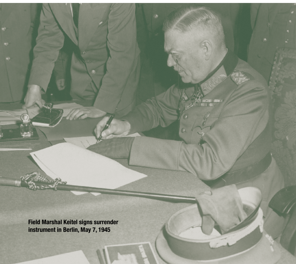
Field Marshal Keitel signs surrender instrument in Berlin, May 7, 1945

55 Franklin D. Roosevelt to Henry L. Stimson, February 6, 1935, Franklin D. Roosevelt and Foreign Affairs , vol. 2, March 1934–August 1935 (Cambridge, MA: Harvard University Press, 1969), 397–398.