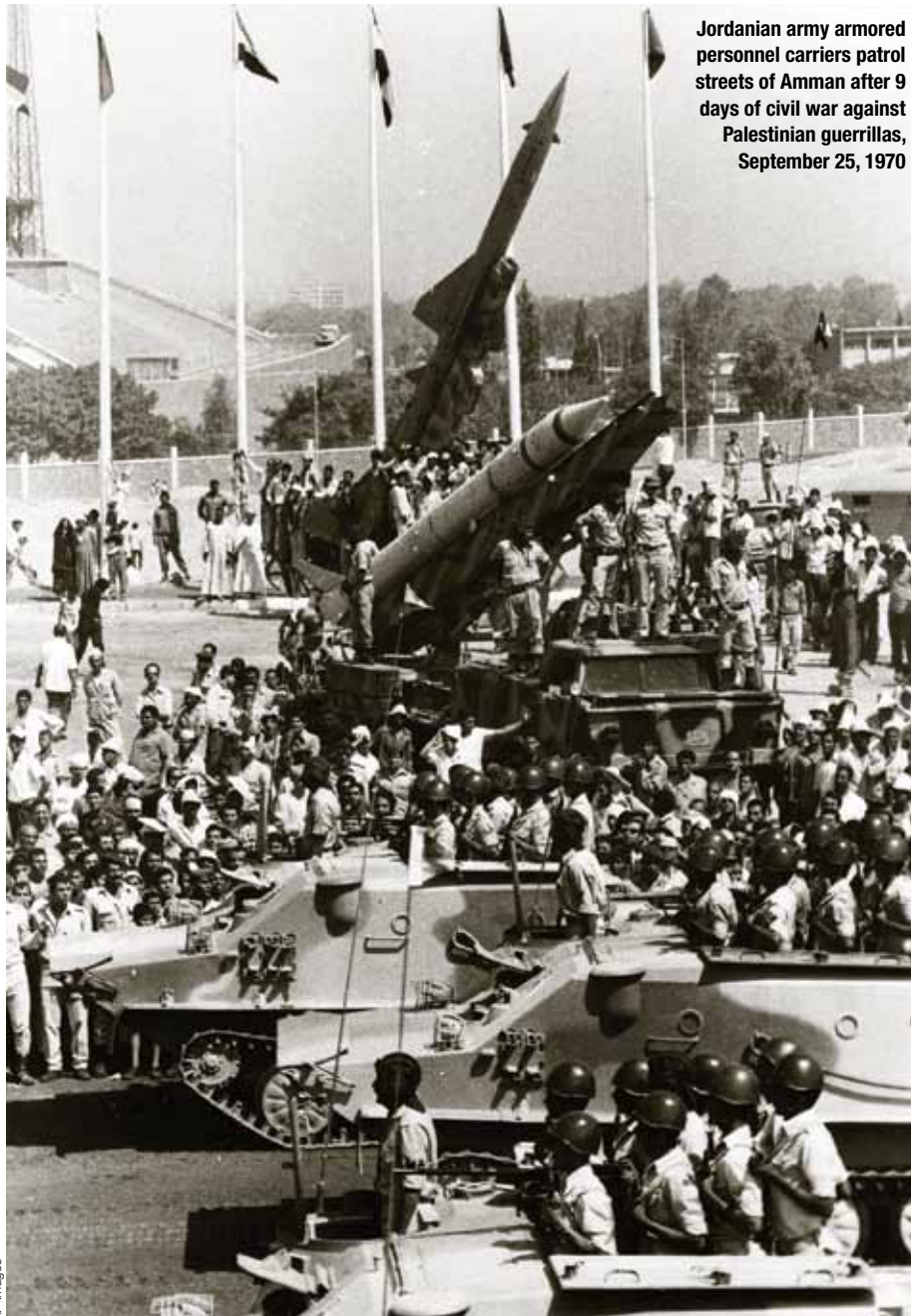
Jordanian army armored personnel carriers patrol streets of Amman after 9 days of civil war against Palestinian guerrillas, September 25, 1970

In the midst of the Jordanian civil war with Palestinians during September 1970, Syria conducted a short-lived armored incursion into northern Jordan. U.S. leaders, seeing Syrian intervention through the prism of Cold War politics, responded with extensive military preparations to intervene on behalf of Jordan's King Hussein and prepared to block Soviet intervention on behalf of Syria. When Syria withdrew its forces after 3 days of combat with the Jordanian army, U.S. decisionmakers not only praised the Jordanian resistance but also concluded that Syria's withdrawal was a victory for U.S. statecraft.