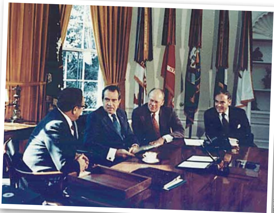
President Nixon meeting with Secretary of State Kissinger, Vice President Ford, and Chief of Staff Alexander Haig in Oval Office