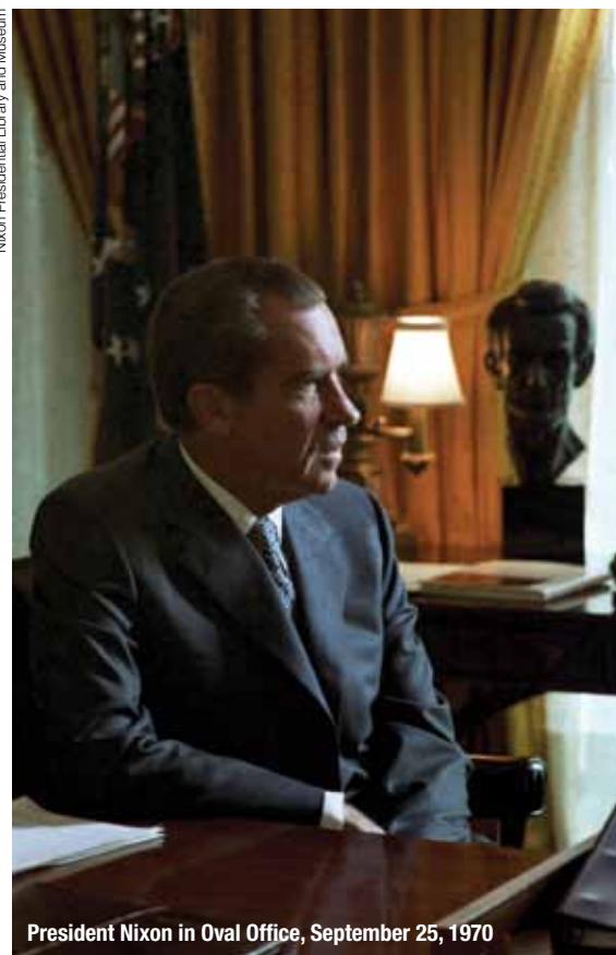
President Nixon in Oval Office, September 25, 1970

the U.S. Ambassador recommended that the United States consider an Israeli “spooking” operation to eject the Syrians from Jordan