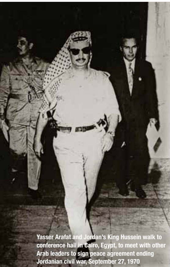
Yasser Arafat and Jordan’s King Hussein walk to conference hall in Cairo, Egypt, to meet with other Arab leaders to sign peace agreement ending Jordanian civil war, September 27, 1970

Syrian and Iraqi public threats against King Hussein between September 17 and 19 raised the possibility that the carriers would soon see combat. President Hashim al-Atasi claimed that Syria would “spare no blood” to help the Palestinians, an insinuation that Damascus might send forces into Jordan. On September 17, Radio Damascus echoed this theme by reporting that the Syrian foreign ministry had warned Jordan’s ambassador that the “Syrian revolution cannot remain