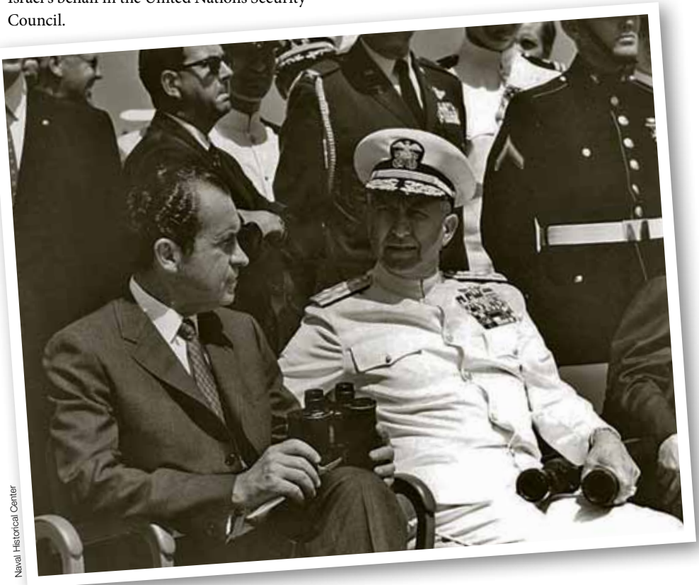
President Nixon with Admiral Thomas H. Moorer, Chairman of the Joint Chiefs of Staff, aboard USS Saratoga prior to deployment to Mediterranean Sea

We have and will continue to make clear to the Soviets our support for Israel's security and integrity and its right to live within defensible borders. In the present crisis, the U.S. has augmented the Sixth Fleet; it has also taken other readiness measures. These clearly imply a decision not to permit Soviet intervention in the conditions under discussion. As for specific measures the