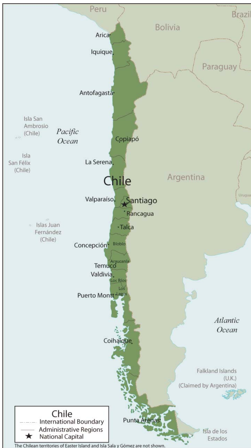
Figure A-1. Map of Chile