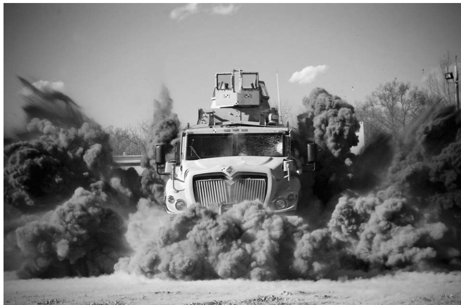
Figure 2. Live fire testing verifies Mine Resistant Ambush Protected (MRAP) vehicle protects Army soldiers

The Chemical Biological Defense (CBD) T&E Division works closely with CBDP stakeholders to provide T&E input to the CBDP Program Objective Memorandum (POM), ensuring T&E infrastructure is maintained and modernized to support adequate developmental and operational testing. The division