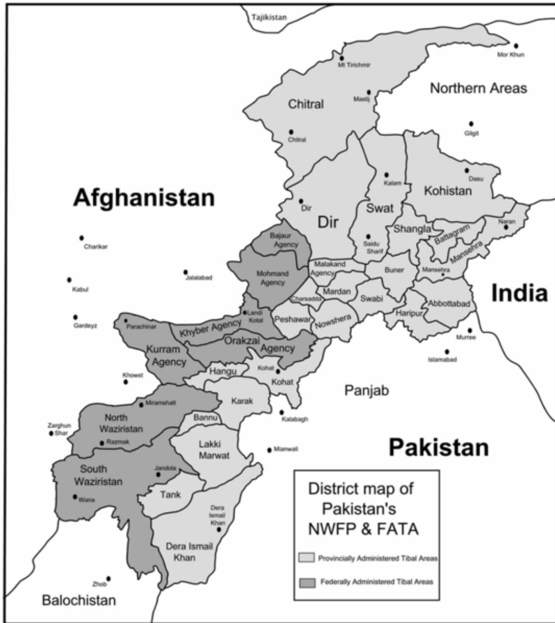
Figure 1: Map of the Federally Administered Tribal Areas, Pakistan 10

Social Context. Sanctuary within the FATA has a social dimension. The al Qaeda network is people, organized and working together for common outcomes. They are generally supported actively by the Pakistani Taliban, and passively by tribal Pashtuns. While elements of the Pashtun social code can explain this support up to a