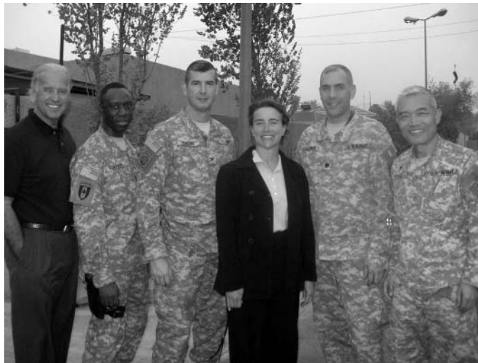
Figure 2. Visit from Senators Biden and Lincoln.

extroverted and a master of verbal and written communication. Ours performed superbly and was one of the busiest officers in the hospital. I, my deputy commanders, and the coordinating staff spent at least 10 percent of our time preparing for and conducting tours for our visitors. I did not consider these tours to be “dog and pony” shows or distractions. Rather, they were a part of our mission essential task list. We needed to engage these visitors in a strategic communications context. Whether we were providing up-to-date progress to a group of senators or letting America know via a media conduit that its sons and daughters were receiving world-class medical care, we had to excel. Our tour performance evolved to the point where we had a multitude of briefings and agendas from which to choose. Based on the demographic of the visitor or group, we could choose from our menu and execute with very little notice.