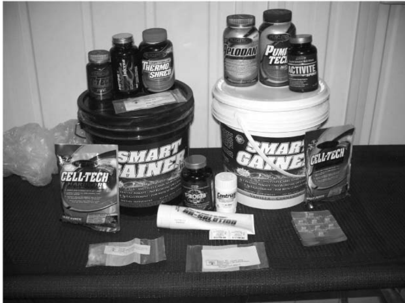
Figure 6. Supplements Found in Dead Soldier's Living Quarters.

The Department of Defense (DoD) should not allow AAFES to sell these products in a combat theater. It is obvious they are a significant source of soldier morbidity, and I further hypothesize they are killing some soldiers. Certainly, soldiers could acquire these items in care packages or online purchases, but their presence on AAFES shelves represents a ringing DoD endorsement. Lawyers argue that we can't proscribe the sale of supplements at AAFES because they are legal products. However, we've managed to keep alcohol and pornography, both of which are also legal, out of the theater AAFES system because of a general order prohibiting them. The same should be done for supplements. As for my health kick, I had a "V8" moment when it suddenly dawned on me that I was working at a hospital that had a pharmacy. The best multivitamin I know of is the prenatal vitamin, and we had it in ample supply. I took one every day.