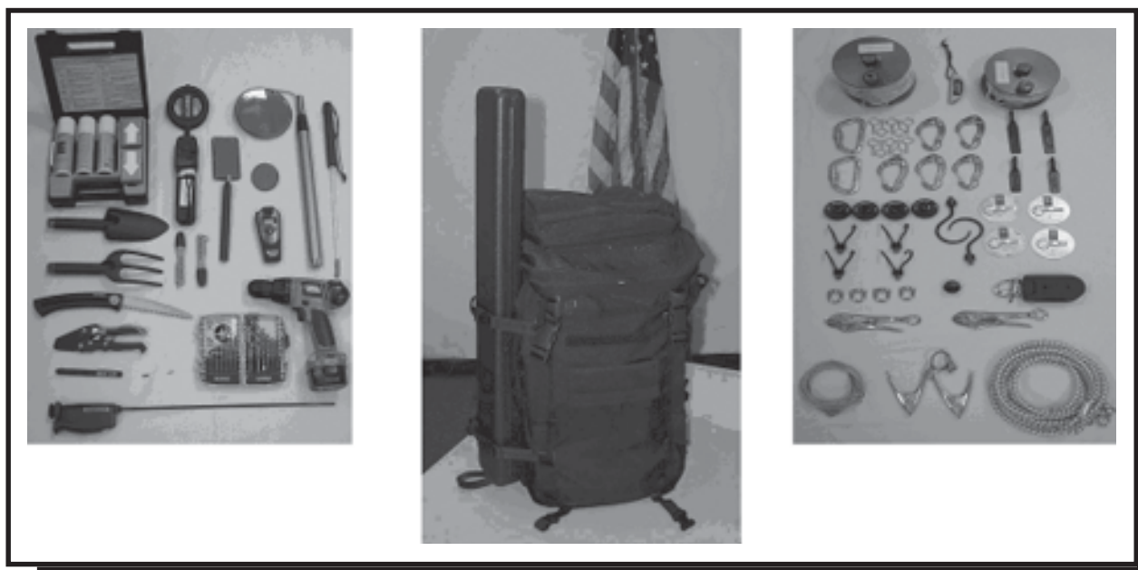
Figure 1. A man-portable kit contains specialized tools and equipment for search teams.

Based on proven British techniques against terrorists in Northern Ireland, Bosnia, and elsewhere, the CEHC training is designed to provide US forces with the technical skills, doctrinal capability, and tools to safely execute counterterrorist search missions. It has spiraled into a 15-day course with four main objectives: protect potential targets, gain evidence, gain intelligence, and deny enemy resources. During this course, which breaks into two tracks during the middle part of the course—Unit Searcher and Unit Search Advisor—the students undertake a number of practical exercises: in-person, vehicle, area, route, and occupied and unoccupied building searches. Additionally, the search advisors concentrate on the planning cycles that are crucial to ensuring successful search missions. To equip soldiers to perform these tasks, the CEHC has prepared a specialized man-portable search kit, which contains all the tools and equipment search teams require to execute this mission (see Figure 1). The CEHC is continually refining this kit and endeavoring to establish a standardized search kit that would be available through the regular supply system. This particular materiel solution crosses three of the five tenets of IED defeat—predict, detect, and prevent.