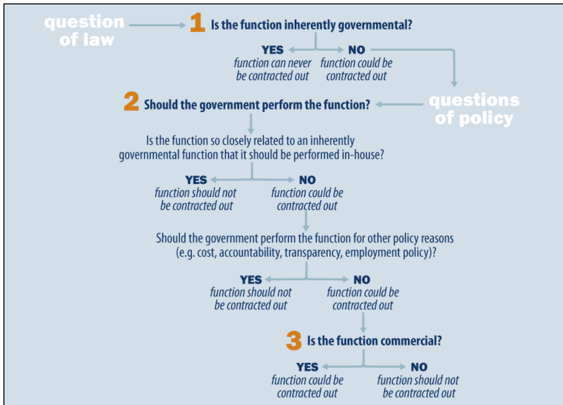
Figure 4.A Possible Framework for Distinguishing Between Questions of Contracting Law and Contracting Policy

“balance” and “reasonableness” in agencies’ use of contractors, as well as their need to “maintain agency capability to perform core functions” have been particularly noted. 209 However, discussions of “balance” and “reasonableness” can have two different focal points. While the focus is often on the perceived overuse of contracting out, there are those who believe that the problem is under-use of the private sector. 210 The Freedom from Government Competition of 2009, for example, takes the latter view. 211 The cost of performing functions is assessed as part of the A-76 process, although there have been some concerns about how accurately this process reflects the costs of either performance in-house or by contractors. 212