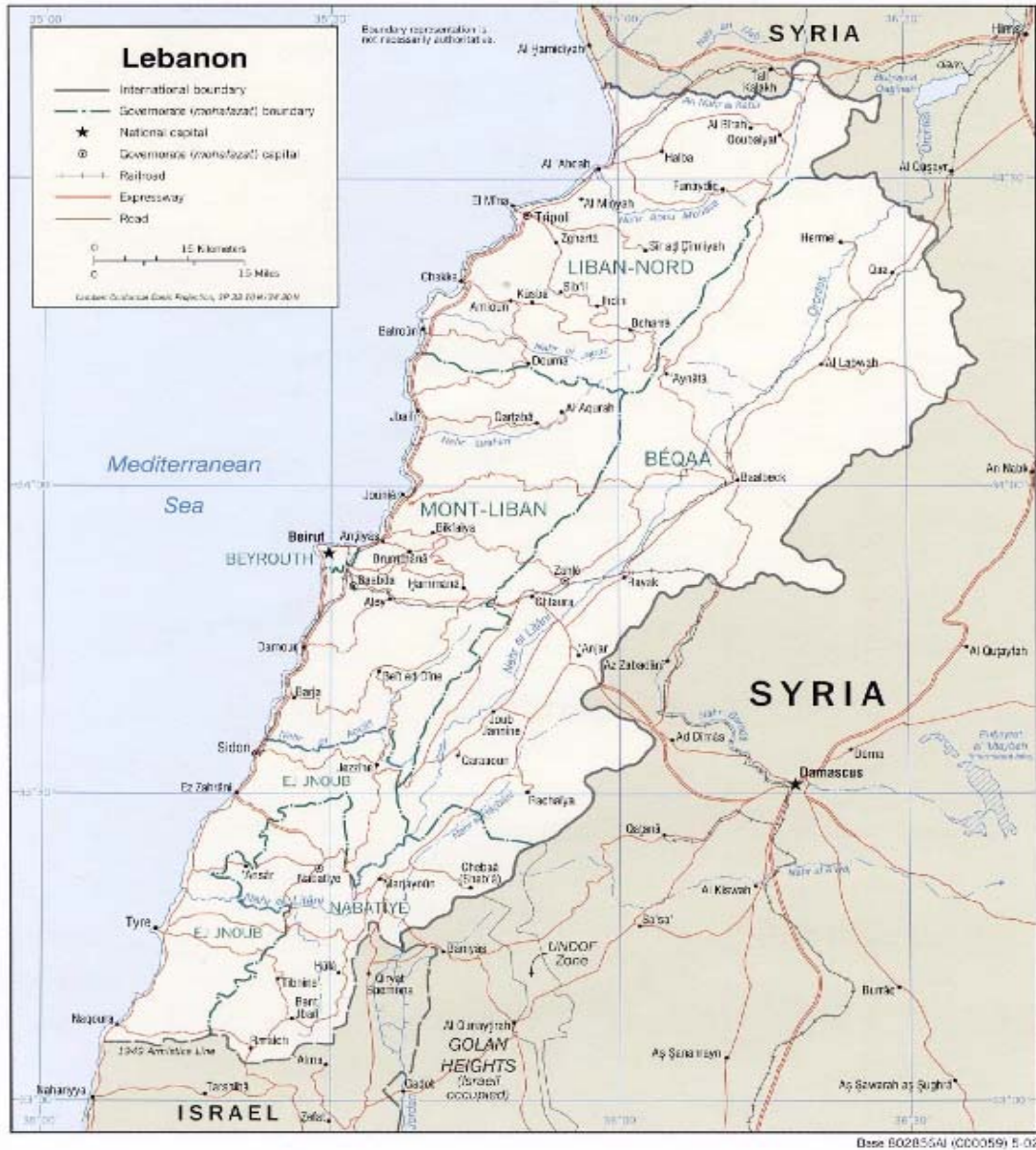
Figure 1. Political Map of Lebanon 127