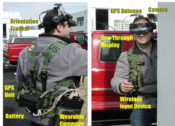
Figure 2: An annotated view of the hardware configuration of the current BARS prototype.

A channel contains a class of objects and distributes information about those objects to members of the channel. Some channels are based on physical areas, and as the user moves through the environment or modifies the spatial filter, the system automatically joins or leaves those channels. Other channels are based on semantic information, such as route information only applicable to one set of users, or phase lines only applicable to another set of users. In this case, the user voluntarily joins the channel containing that information, or a commander can join that user to the channel.