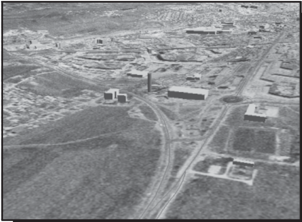
Figure 1. Urban Tactical Planner

It is essential that we continue to sustain these teams with current, updated hardware and software and—more importantly—with trained, motivated soldiers who can make innovative products in the field to support the warfighter. It is also essential that these teams remain tightly linked to reachback assets to ensure that they have the very best possible products available for the maneuver element.