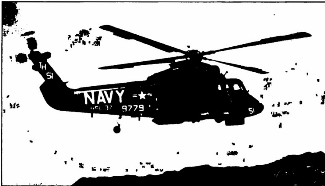
SH-2 Sea Sprite Anti-submarine Warfare Helicopter.

With eight ex-Knox class frigates well integrated and operating within their Navy, Turkish Naval Forces Command (TNFC) has sought the help and advice of NAD in the maintenance and upgrade of the ships. On the maintenance side, NAD has coordinated several site surveys and assistance team visits to Turkish shipyards and is currently assisting with boiler inspections for the Knox class frigates. These visits include surveys of calibration facilities and circuit card repair facilities, as well as a review of capabilities required specifically for the support of Knox class frigates. To assist with the upgrade of Knox capabilities, NAD is coordinating the transfer of 14 excess U.S. Navy SH-2F Sea Sprite helicopters and associated support equipment. The addition of these helicopters to the aviation arm of the Turkish Navy will greatly enhance capabilities in this area. Recent initiatives by NAD have significantly lowered the transfer cost of these aircraft and equipment to further assist the Turkish Navy.