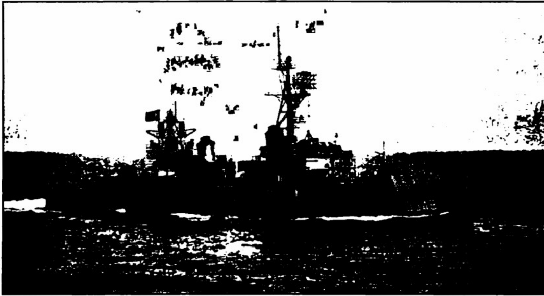
Gearing class destroyers are being replaced by Knox class frigates.

ments. Close liaison between all activities enabled the U.S. Navy to transfer the ships two months early.