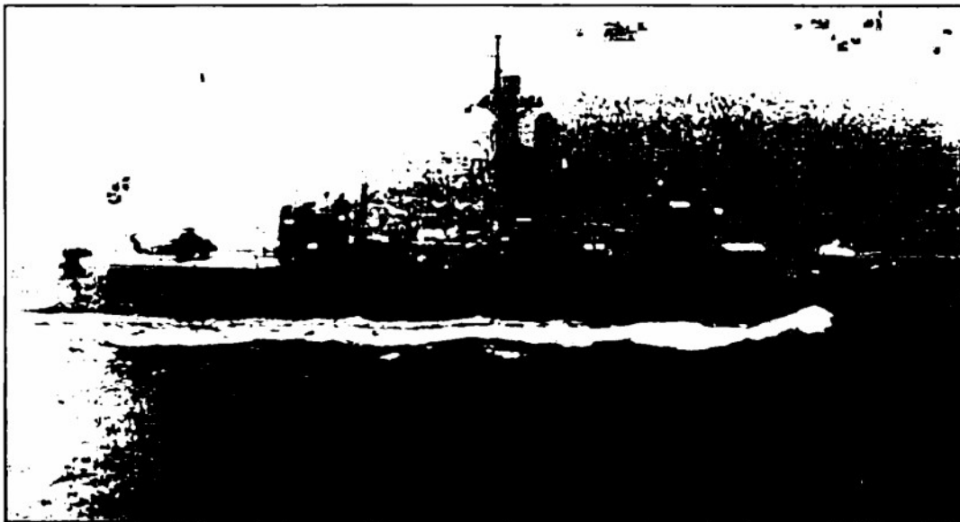
Knox class frigate underway conducting operations with a SH-2 Sea Sprite Helicopter.

Having accomplished the timely delivery of the first four frigates, NAD and the U.S. Navy were soon challenged again by the Turkish Navy to transfer the second set of four frigates in six months. Again, NAD established the necessary contacts and coordinated a smooth transfer which culminated in a dedication ceremony for all eight frigates at the main Turkish naval base at Golcuk in July 1994, which was addressed by both the Turkish President and Prime Minister. Since their turnover, the ships have operated safely and reliably, and have significantly increased Turkish Navy capabilities.