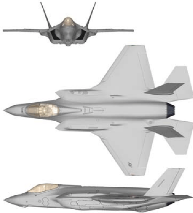
Figure 1. F-35 Lightning II Joint Strike Fighter